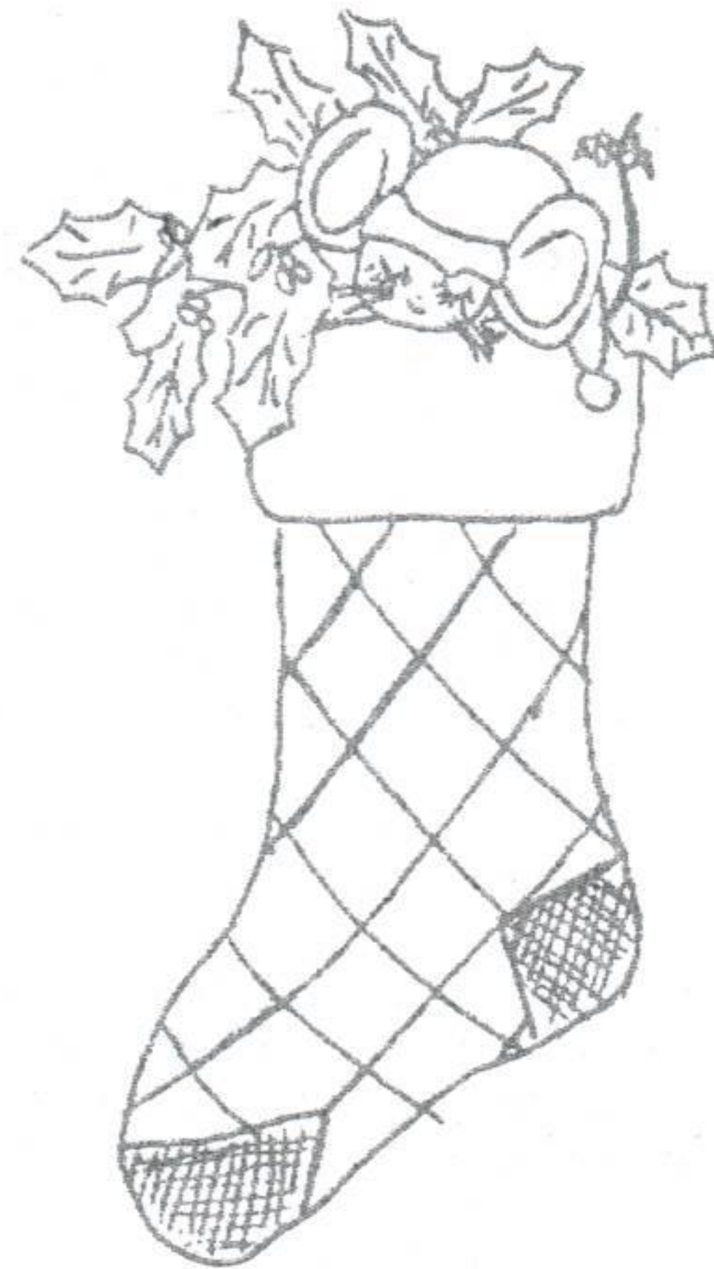
ANNUAL HQ CHRISTMAS PARTY

* Be careful of mobile toys with strings, cords or loops. They should not be used in cribs or playpens where children are old enough to sit or stand and this become entangled;