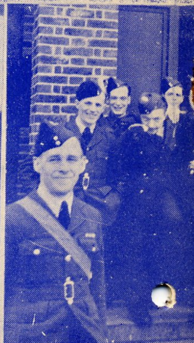
Upper left—400 Squadron Chapel, Christmas, 1941. Upper right—The Recreation Room of a Canadian S. N.C.O.s, Guests of the Officers at Christmas Festivities. Lower right—Wing Command