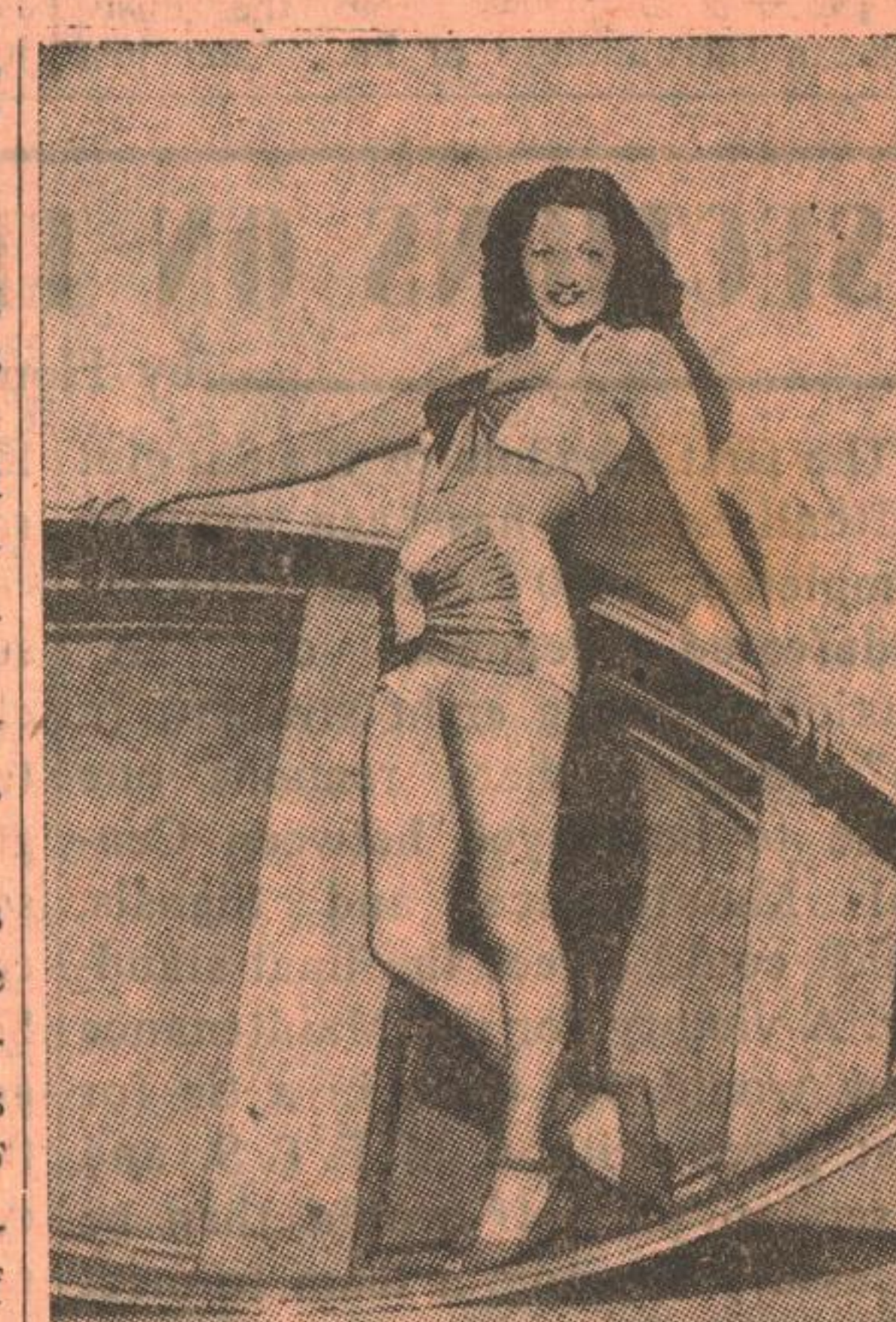
Yvonne de Carlo

"The place was jumpin'" during the number "Harry James Jam"