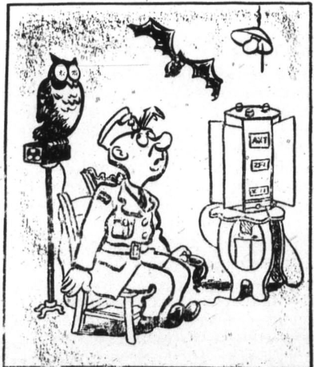
The dark hole of Victoriaville