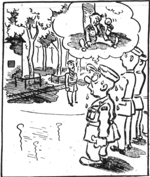
In the good old summer-time.