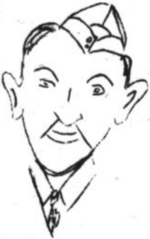
BEFORE WIRELESS SCHOOL.