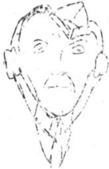
DURING WIRELESS SCHOOL.