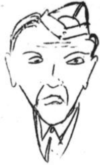
AFTER WIRELESS SCHOOL.