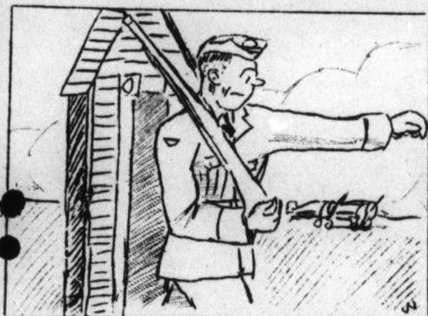
WE FLEW, ALRIGHT!!

I am a WAG; I've pretty proud of it too. Yessir, since people look down on WAGS, while others look up to them, and