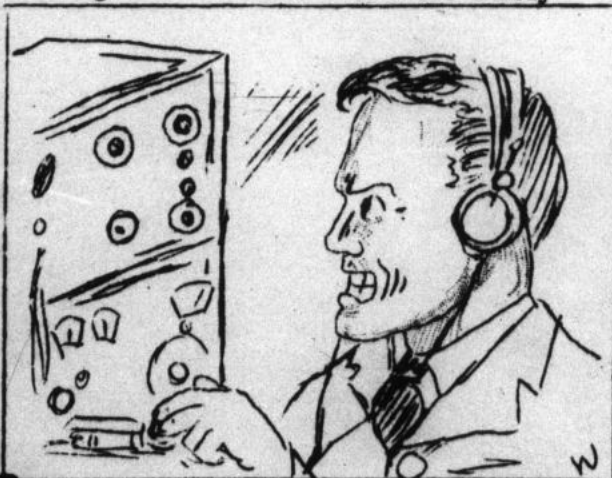
IT GOT MORSE AND MORSE

First of all, I joined the airforce without even a hazy idea of what it was all about. I wonder if I do now. I had an idea that I was going to fly. I wasn't wrong. I flew around Ottawa for nearly