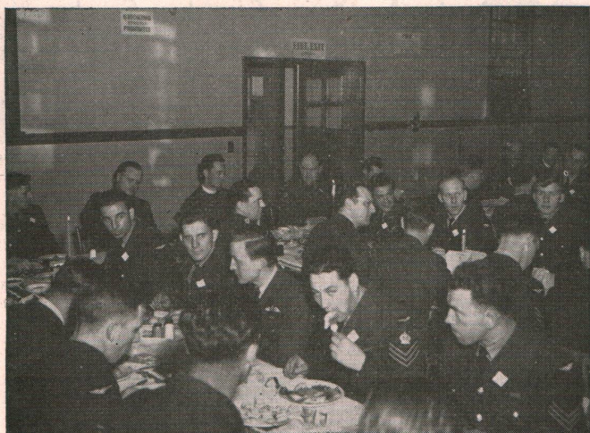
A Formal "DO" at the Sgts Mess