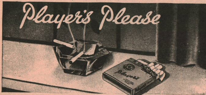
THE MILDEST BEST-TASTING CIGARETTE

NOW AVAILABLE AT THE "RCAF PRESS SHOP" 7 HR DRY CLEANING SERVICE