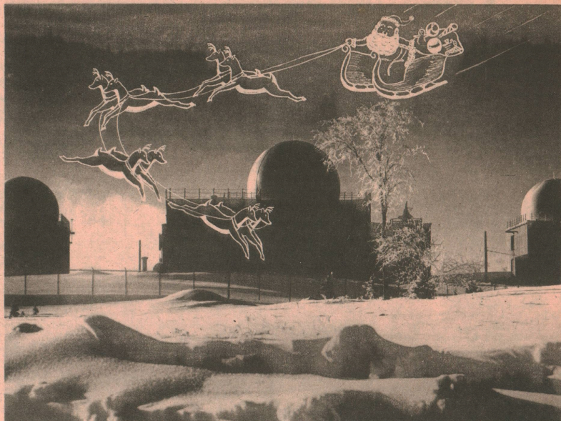
St. Hubert, Que., - December -- FIRST LANDING -- Just to make sure that Santa Claus and his reindeer have a safe journey from the North Pole on Christmas Eve the RCAF's Air Defence Command radar units in the north have been alerted to keep an eye out for the jolly old fellow. This is the scene personnel manning this radar site, expect to see sometime on Christmas Eve as Santa comes in for a landing on his way south.

Assumption No. 1 is that there is no protection against radioactivity. The scene is laid in Australia, and although no bomb has fallen in the Southern Hemisphere, a vast global belt of lethal radiation is slowly but inexorably moving over the world, killing everything in its path. So Dwight and Moira - or, if you prefer, Gregory Peck and Ava Gardner - are doomed, to an untimely end, like all the other characters