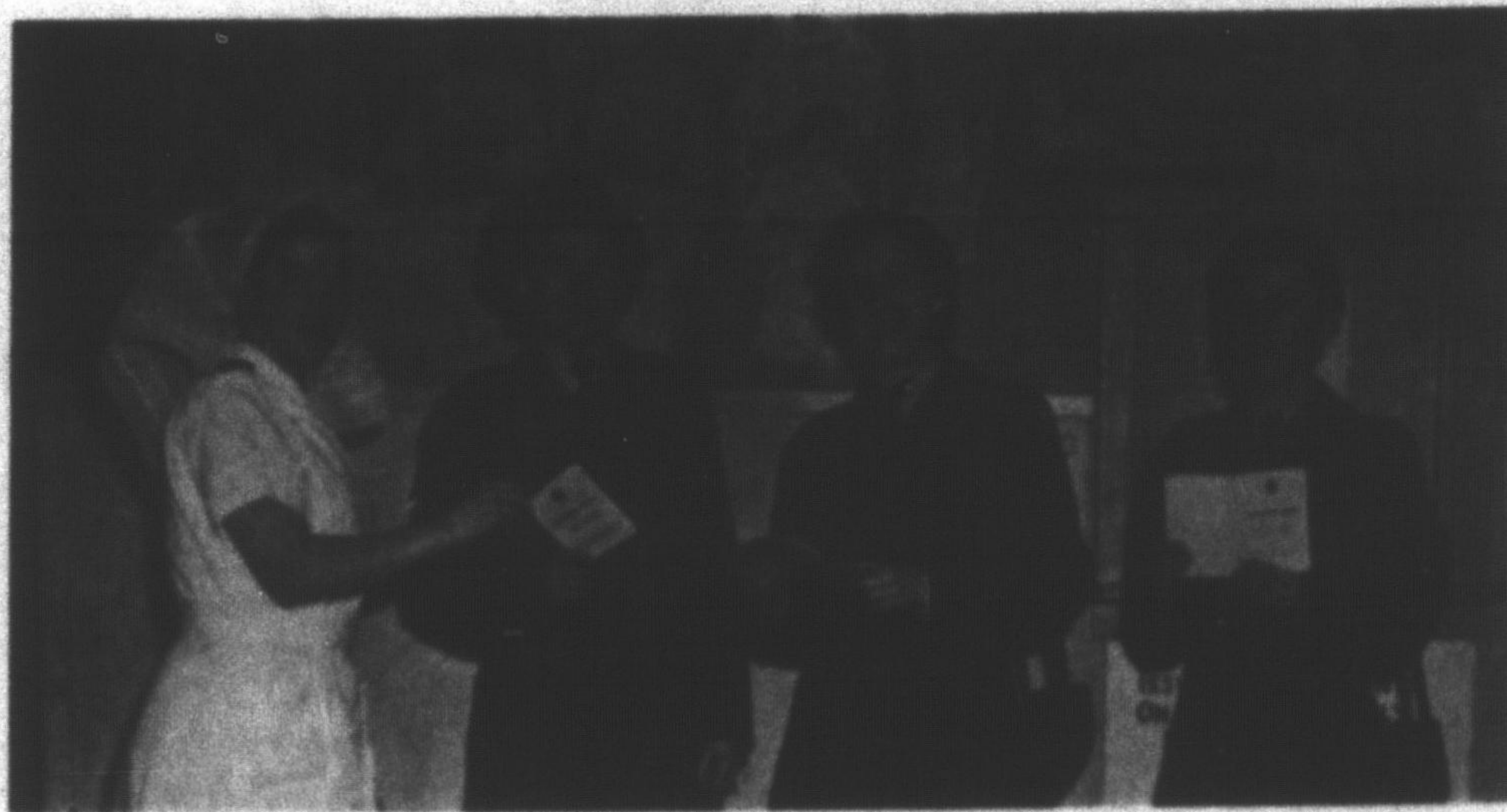
THE LUCKY WINNERS