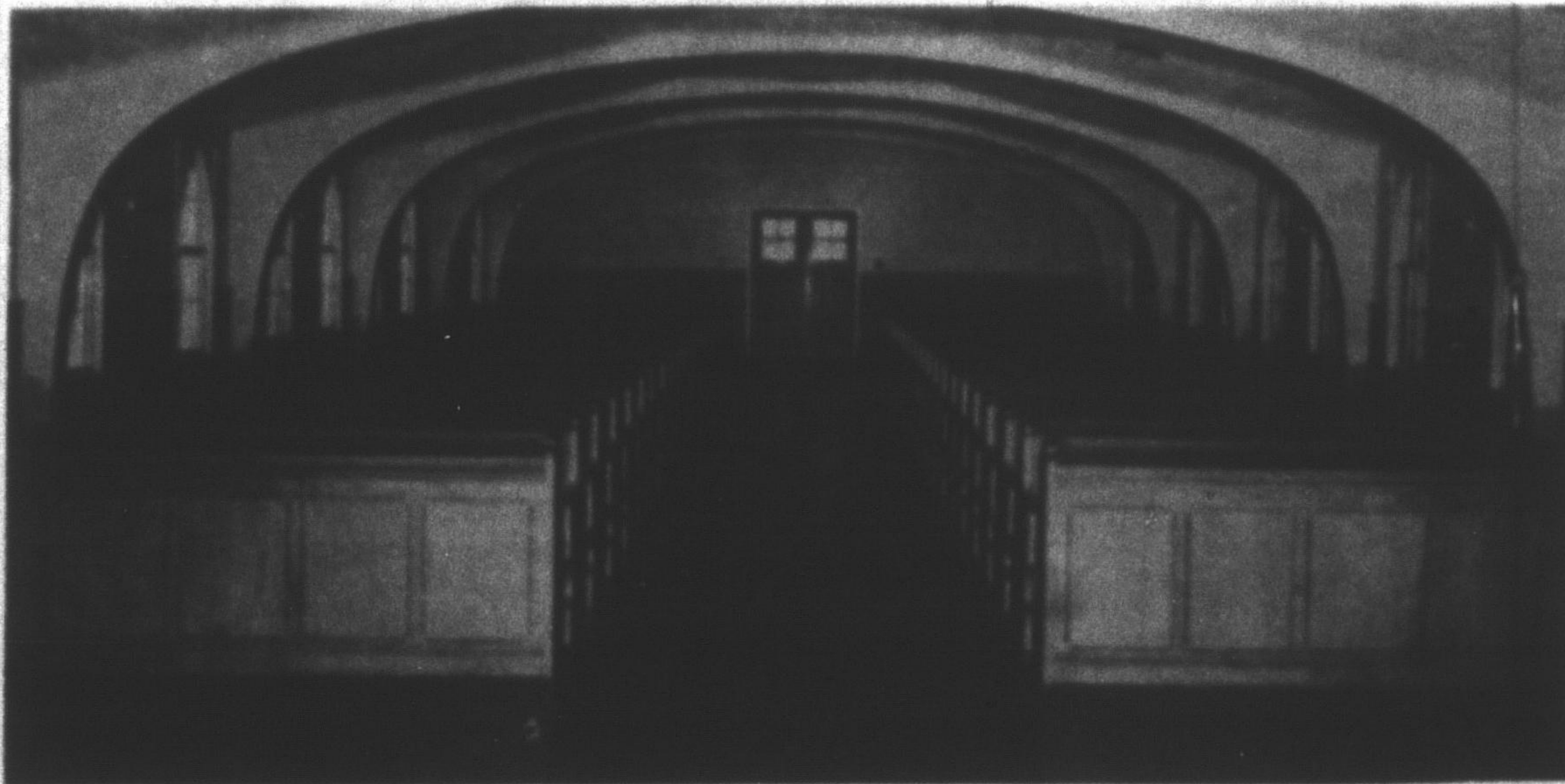
VIEW OF SEATING ARRANGEMENT OF THE PROTESTANT CHAPEL. THE GENERAL DESIGN IS COMPARABLE IN BOTH CHAPELS.

While it is true that there are still a few minor improvements and additions to be made, yet the people are already very happy with our beautiful new RCAF Chapel where one can feel very close to God.