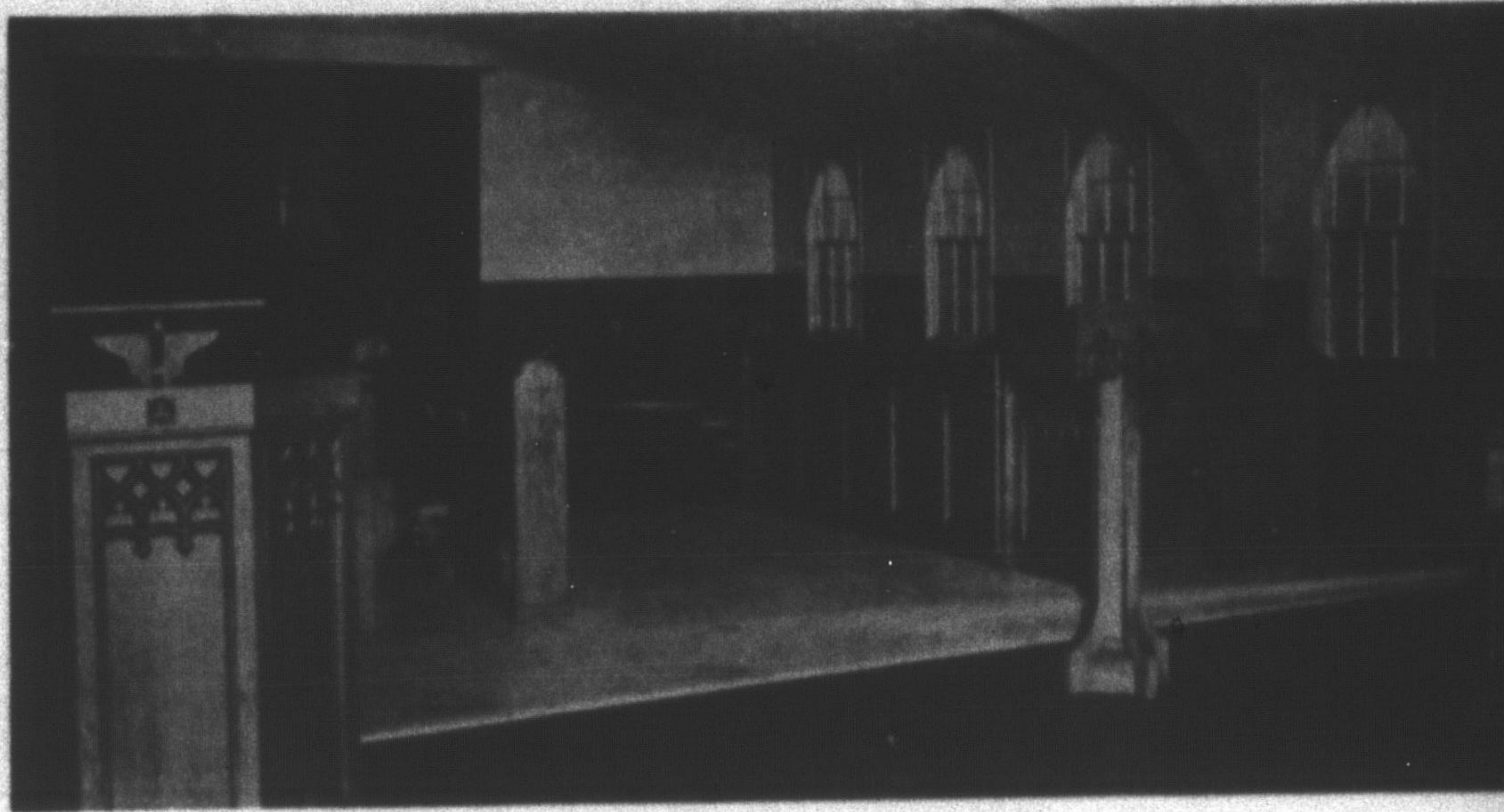
VIEW OF ALTAR IN PROTESTANT CHAPEL