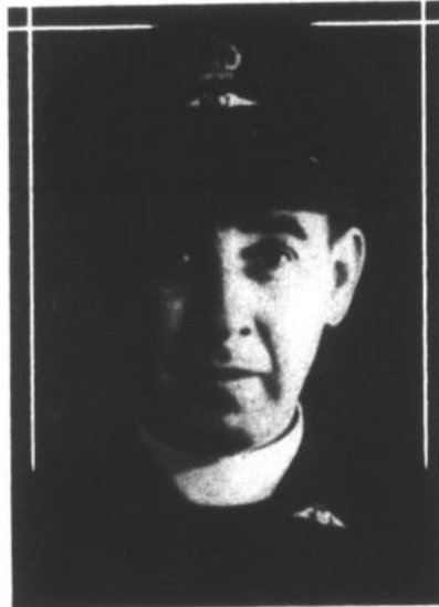
In addition to ministering to the R.C.'s on the Station, he teaches a full university course at St. Peter's Seminary, London.

He's the man with the widest, happiest smile on the Station. It just won't come off. No matter where you see him—even when he strikes out with the bases loaded and two out—he's always smiling.