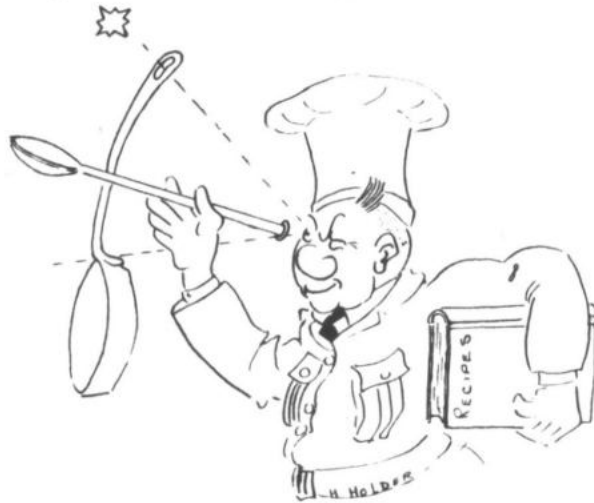
MAN IS NOT LOST — SO LONG AS HE CAN COOK!