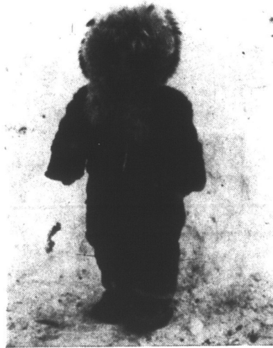
The Author makes friends with little Eskimo boy.