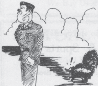
CHEE! STRIPES TOO!

Be sure to see our farewell observations, and air ops experiences in the next edition. It should be good.