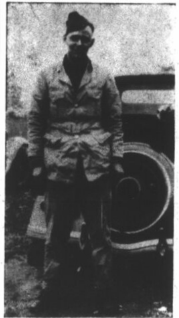
BEATON AND JALOPY

Fingalite Spends Adventurous "48" in Detroit