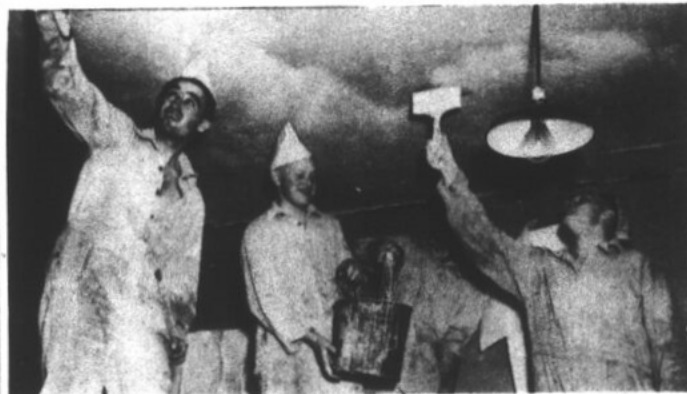
NOPE, THEY'RE NOT CLOWNS—JUST JOES