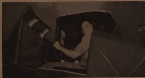
FAREWELL, OLD LINK, FAREWELL!

In conclusion, ah would just like tae say that ah think that your canteen, lounge, an' swimming pool are super-dooper, an' ah'm hopin' that in the near future somebody will stert tae agitate for a museum or zoological gardens. Let's no be half-hearted aboot improvin' the amenities o' the camp.