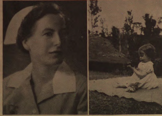
THE AUTHOR AND HIS FAMILY