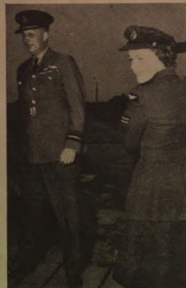
A/V/M AT FINGAL