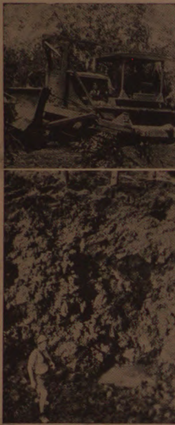
SCENE OF ACTION

FOR the next two weeks I was doing odd jobs, driving trucks to Singapore for stores and up to Mersing, where the Aussies were. I spent a week in hospital and dur-