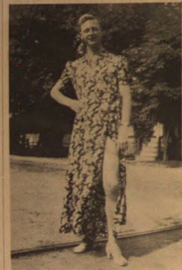
WHO IS SHE?