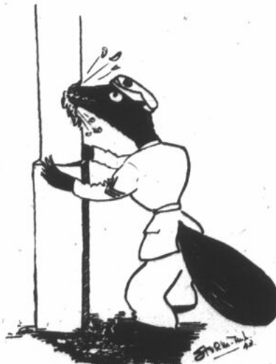
"The Beaver Club"