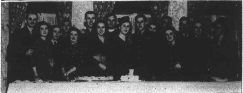
One big happy family—or a wedding for sixteen?