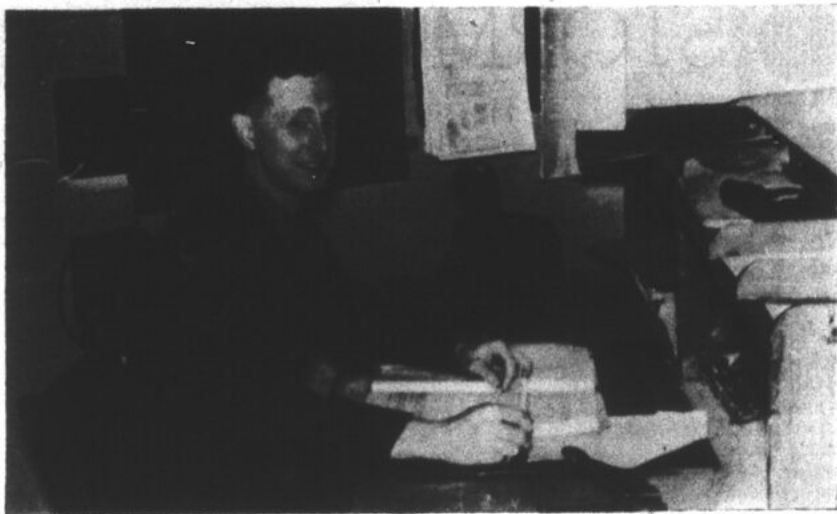
"Smudge-Pot"—of flare path fame, sitting at his desk in Bombing Flight—on strength as Cpl. Dixon.