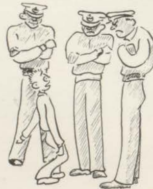
The student who landed with his wheels up!

The first Anson to land in the station was old venerable, No. 6050, which unfortunately reached the end of its service days here after a forced landing at St. George, December 16, 1940. The aircraft was dismantled and sent to No. 6 A.R.D., where necessary repairs were effected, and when