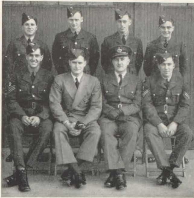
This Happy Group Runs the Drill and Recreation Halls