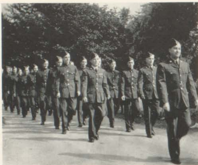
Brantford on the March

Long before the war, it was generally recognized that our part in the struggle ahead was unique in that Canada was capable of producing airmen and aircrews of a quality which our enemies have never been able to equal. From these thoughts abroad and here was born the great program known as the British Commonwealth Air Training Plan whose duty it is to guarantee the Motherland and the Empire a steady flow of the finest aircrews it is possible to produce.