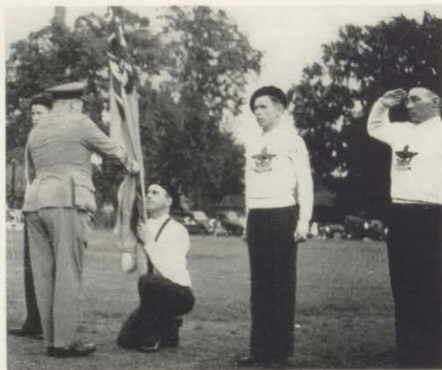
Paris Gets Its Colors

There are three squadrons of Air Cadets affiliated with this station. How many personnel