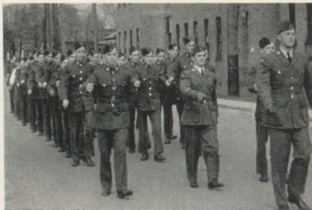
Woodstock Swings Out

This great plan, enormous in its conception, gigantic in its results, is now an accomplished fact. The aerodromes are built; the schools are operating, the training is in full progress. It now remains for us to keep a steady flow of potential aircrew into these schools. And where, on all the earth, can there be found youth better equipped by nature and heredity to pursue the science of aeronautics, than in our own Canada? Canada, who gave us Bishop, Colishaw, Barker, McLeod and countless other heroes of the last Great War and the hundreds of superb Canadian youths who have already won more than 200 decorations for bravery in the present struggle.