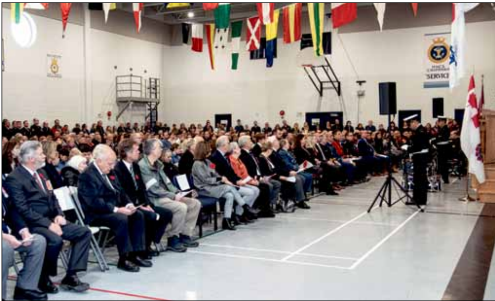
2019 Remembrance Day Services on November 11, 2019 at HMCS Chippawa, 1 Navy Way, Winnipeg, MB.