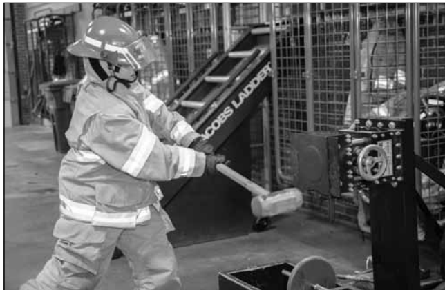
Students in Grade 9 take on parts of the fire fighting Physical Training test during their Bring Your Kids to Work tour on November 6th, 2019 at 17 Wing.