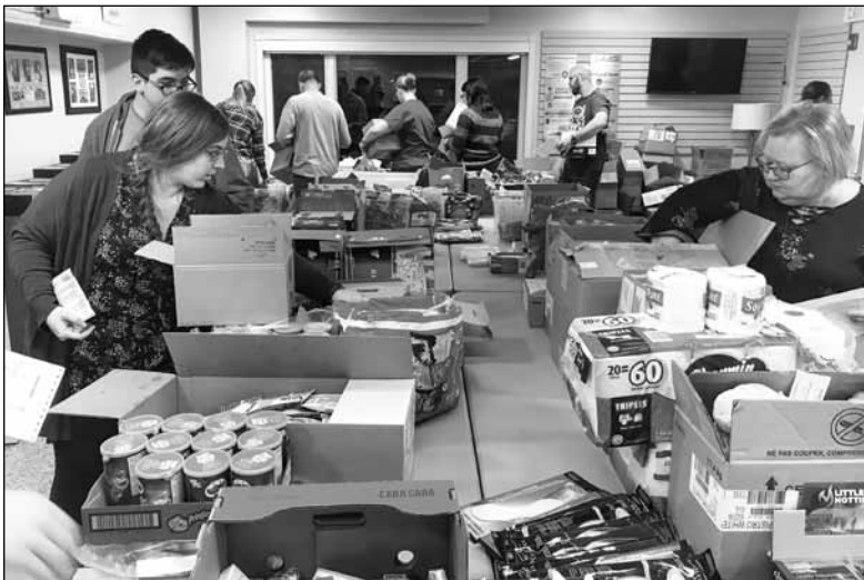
Volunteers at Winnipeg MFRC assemble care packages for members and their families deployed overseas.