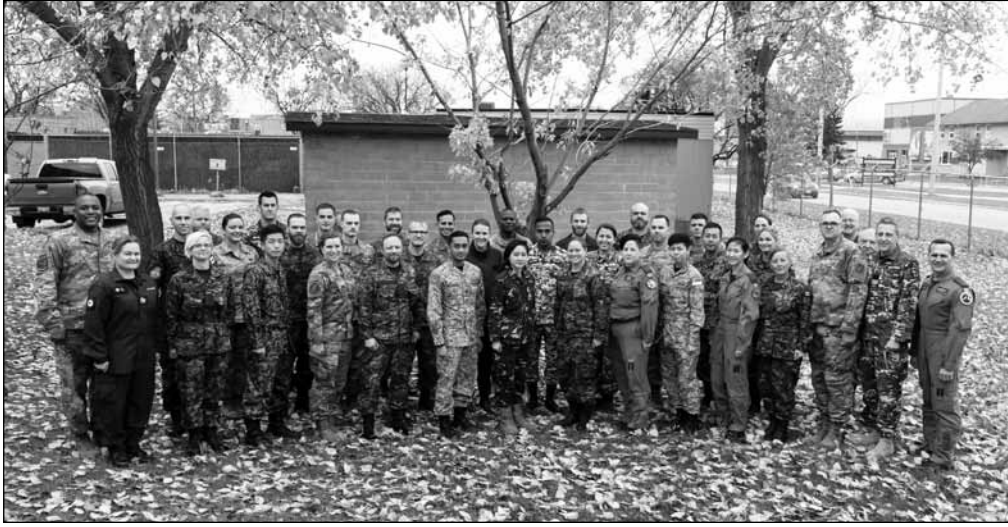
Junior Enlisted Leadership Forum at 17 Wing on October 21-25, 2019.