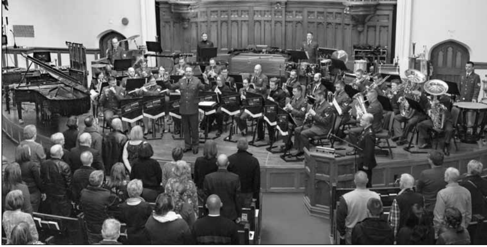
The RCAF Band plays a concert at the Westminster United Church, Winnipeg, Manitoba on November 8, 2019.