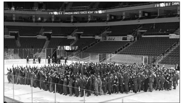
Winnipeg Jets players join CAF members for the tradition post-game picture at centre ice.

"I think it's fantastic for both the military and the Winnipeg Jets, and the community at large to be exposed to the military in their community," he remarked.