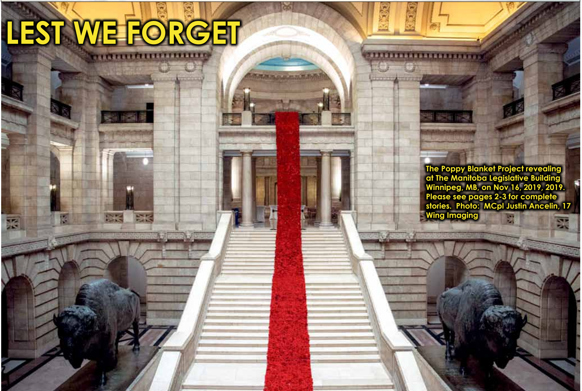
The Poppy Blanket Project revealing at The Manitoba Legislative Building Winnipeg, MB, on Nov 16, 2019, 2019. Please see pages 2-3 for complete stories.

Winnipeg Remembers at Convention Centre Service