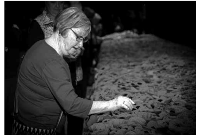
Attendees experience the Poppy Blanket during Remembrance Day Service at the RBC Convention Center, Winnipeg, MB on November 11, 2019.

"It's always lovely to see a large crowd come out to pay respects and give honour to those who served," she said, noting that the Poppy Quilt will be on display in the Provincial Legislative Building. "I feel blessed to be in a place where we get to say our thanks in such a wonderful way."