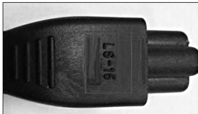
The recalled LS-15 power cords.

For your convenience, a phone number has been set up to provide callers with info on service times and contact with the chaplain of your choice. Phone 833-2500 ext. 6800 and follow the prompts. Those with access to the DIN visit the chaplains' Web Site at http://17wing.winnipeg.mil.ca/main , then click on 'Services'.