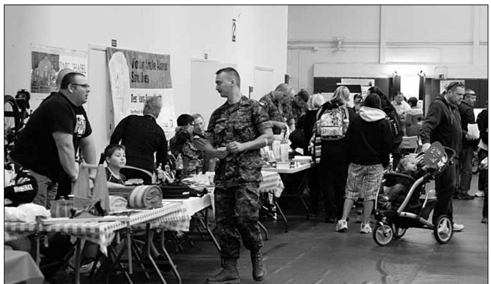
17 Wing members and their families browse the many displays highlighting clubs and programs at 17 Wing.

COMMISSIONAIRES TRUSTED. EVERYDAY. EVERYWHERE. www.commissionaires.mb.ca 942-9553