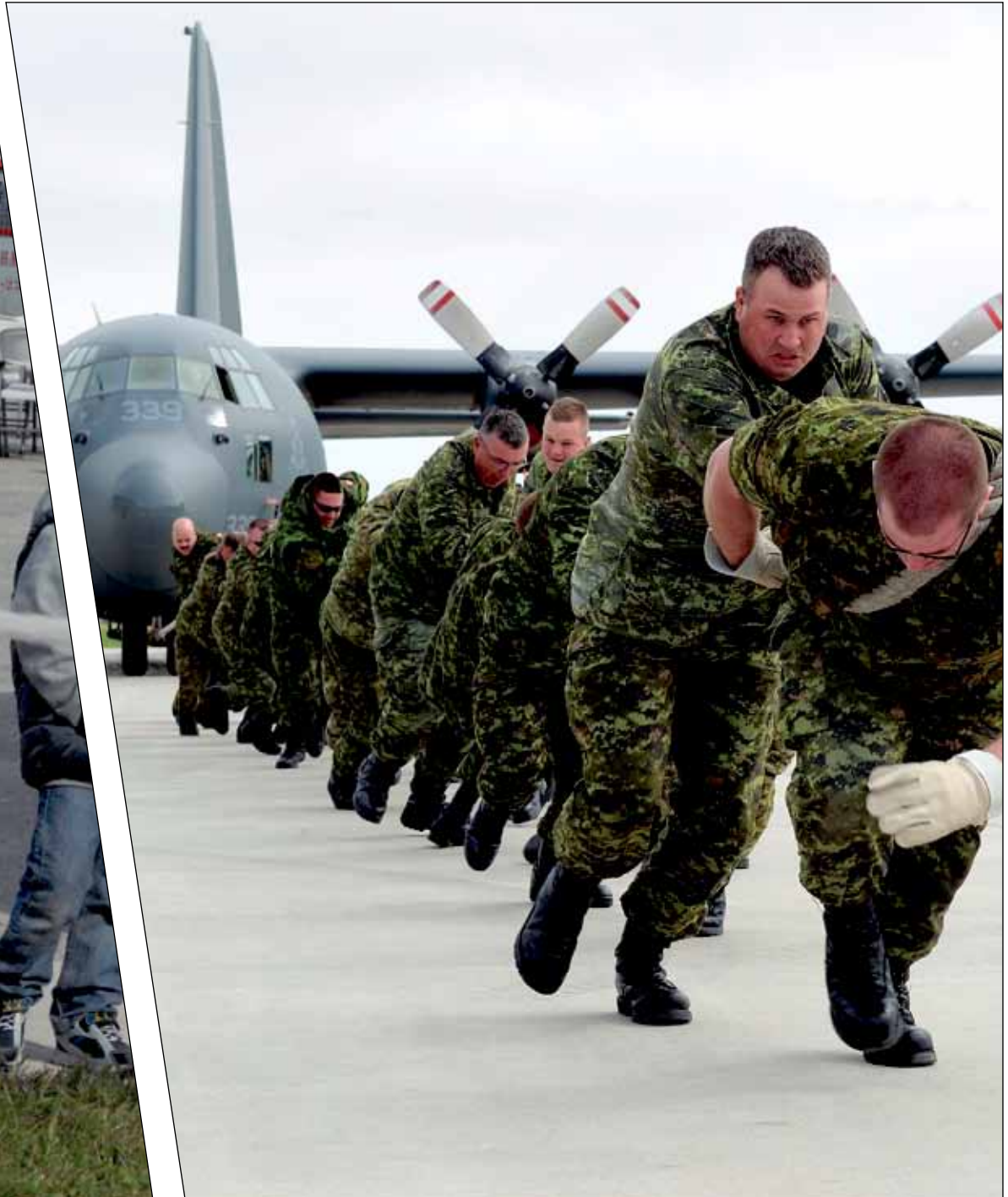
Left: A young attendee of the Fall Fair is assisted in using a fire hose to knock down targets. For more, see page 5. Right: 17 Wing Logistics and Engineering (WLE) team, take first place with a time of 13:53, during the annual GCWCC Kick-Off and Herc Pull, held on Sept 10th. For more, see page 2.