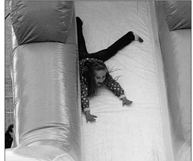
The inflatable bounce slide was enjoyed by many.

"It's good to be able to showcase it for the families, and seeing all the kids enjoying themselves."