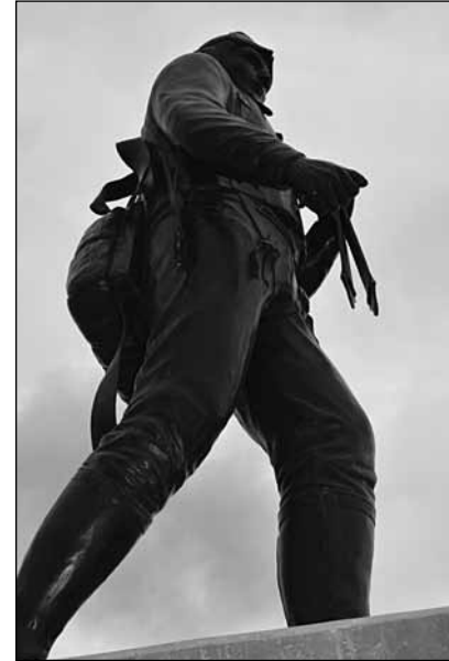
A lone, bronze airman strides forward with purpose towards McGill Field, site of the Commonwealth Air Training Plan Museum. Designed and sculpted by Begg Bronzes, the airman is one of the prominent features of the RCAF WWII Memorial, unveiled on Wednesday, September 10, 2014, seventy-five years after Canada entered into the Second World War.