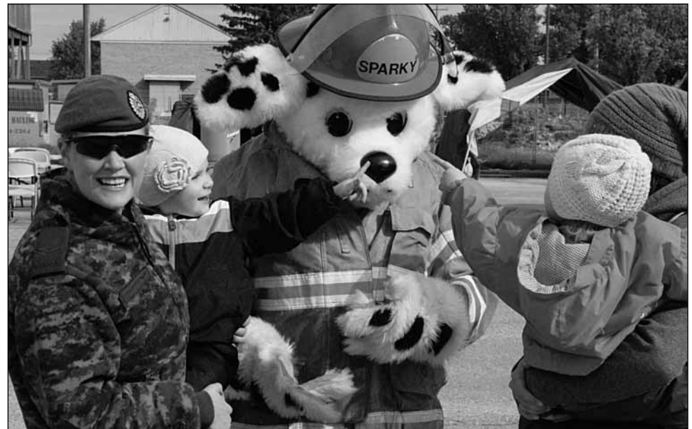
Firehall mascot Sparky is always popular with kids!

Call today for your free consultation Cell: (204) 291-7778 • Fax: (204) 661-4701 Visit our website: www.johndickenterprises.com BBB