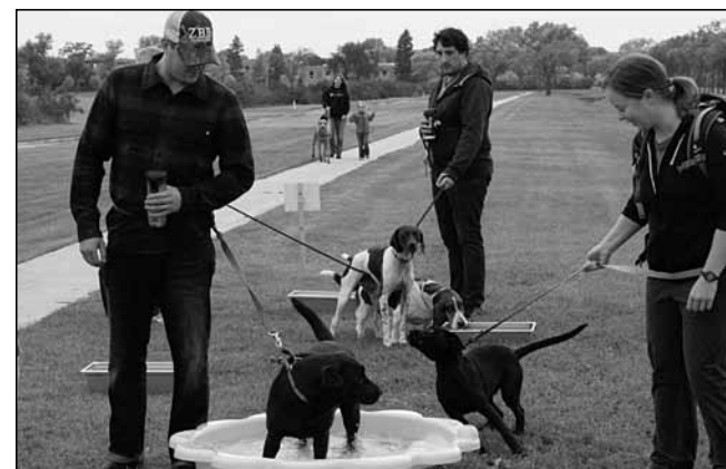
A few dogs take a water break during the Family Dog Walk in support of the GCWCC.