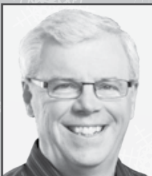
Greg Selinger MLA for St. Boniface Premier of Manitoba 204-237-9247 GregSelinger.ca