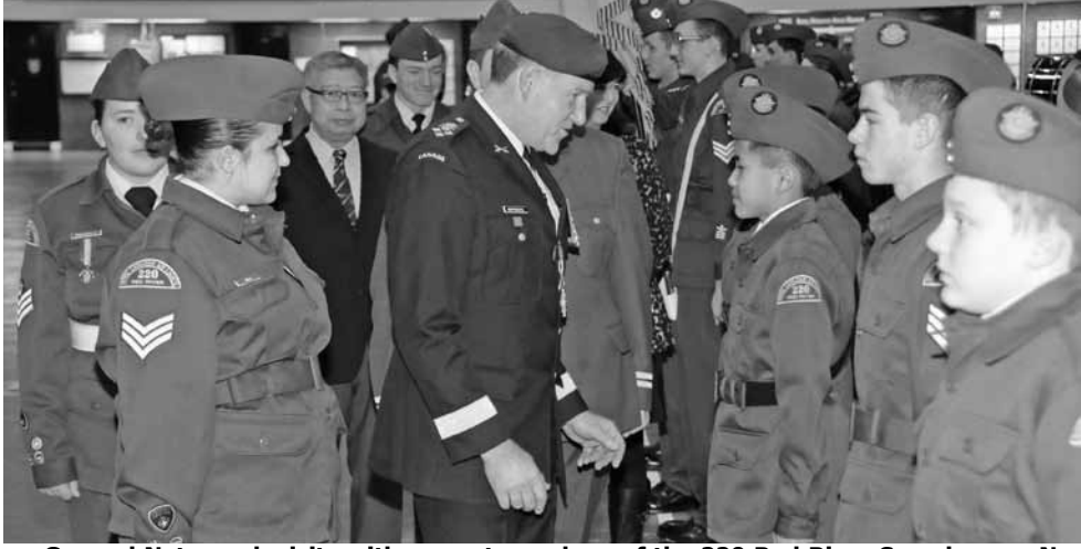
General Natynczyk visits with current members of the 220 Red River Squadron on November 25th.