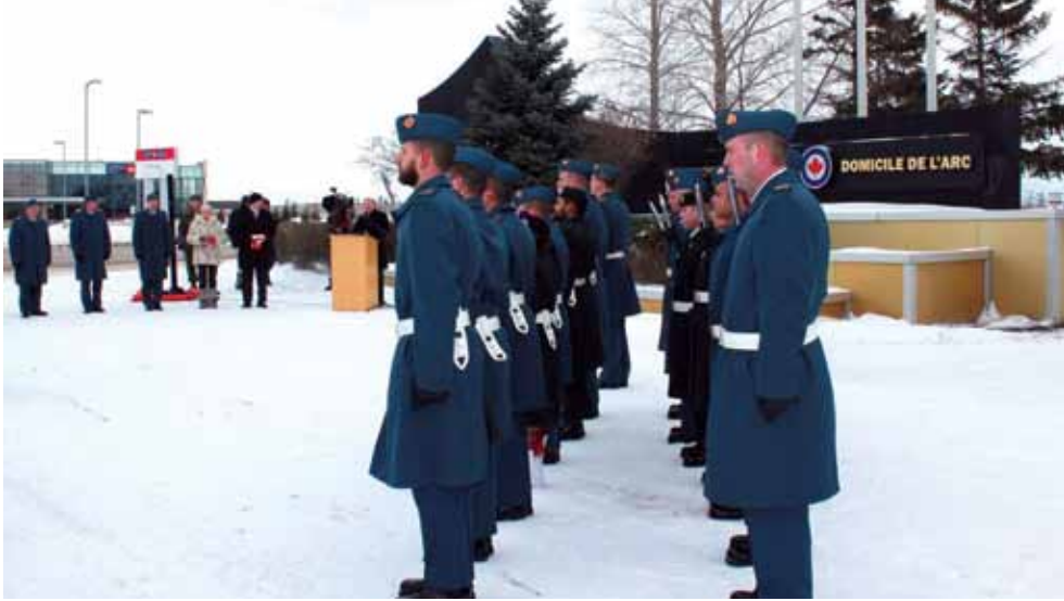
A Canadian Forces Honour Guard braved the frigid temperatures at the ceremony to lend a sense of distinction and formality to the proceedings.