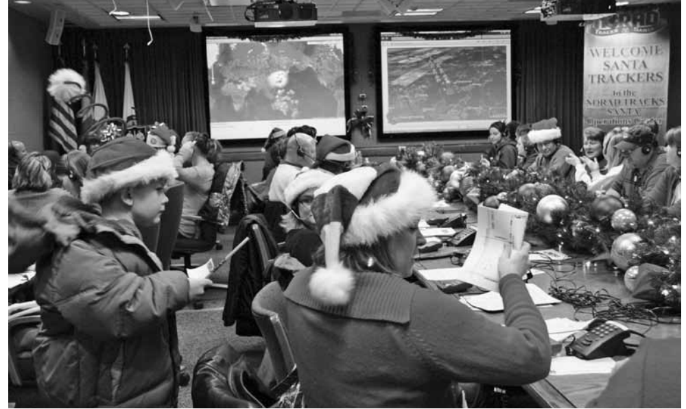
Volunteers work the phones and e-mails at the NORAD Tracks Santa Operations Centre in Colorado Springs.