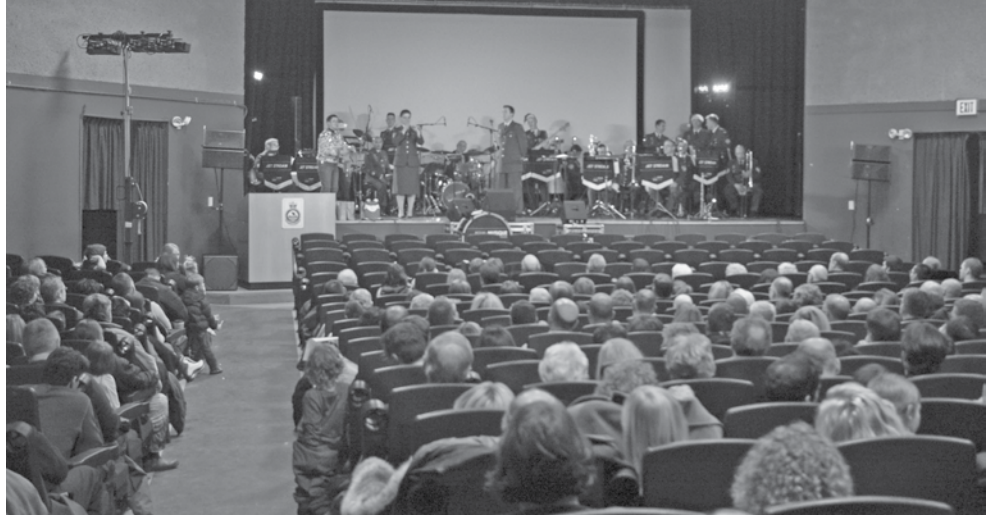
The RCAF Band, Jet Stream, performed for a crowd of close to 400 in the theatre of building 90 on December 9th, 2012. $1,347 and numerous toys were donated to the Care and Share Fund.