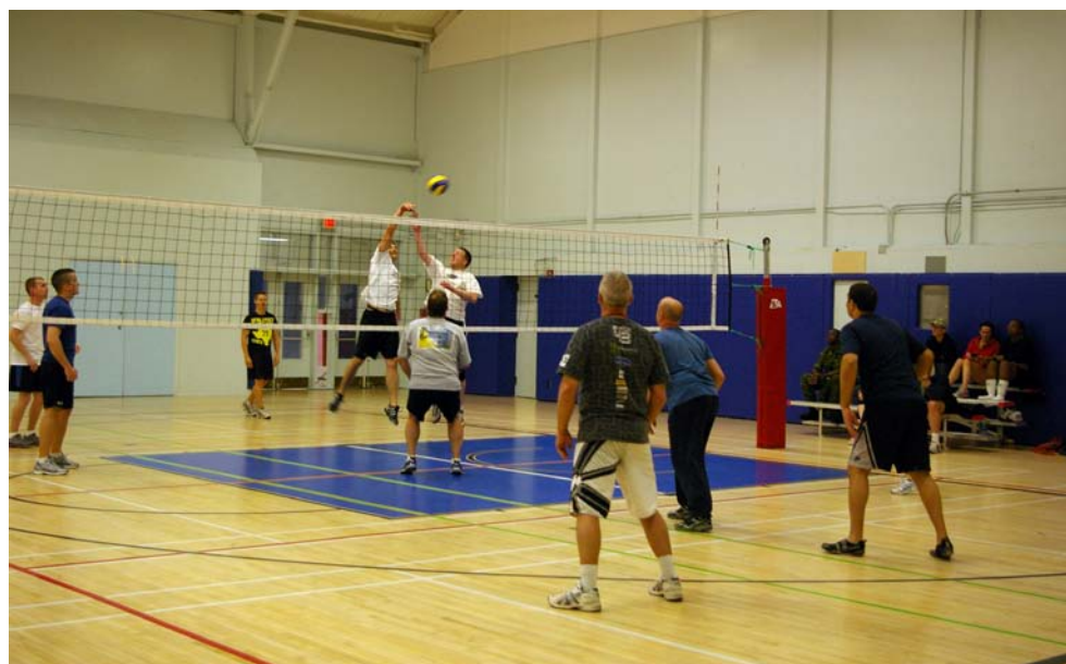
It was the Wing Replenishing team vs. the 1 CFFTS team competing for top honours in the B Division final.