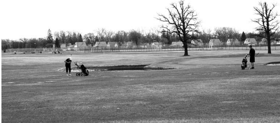
The beautiful weather on April 23rd and 24th drew quite a few people out to the golf course at 17 Wing in order to play a couple of rounds. For more information on the golf club, contact the manager at local 6909.