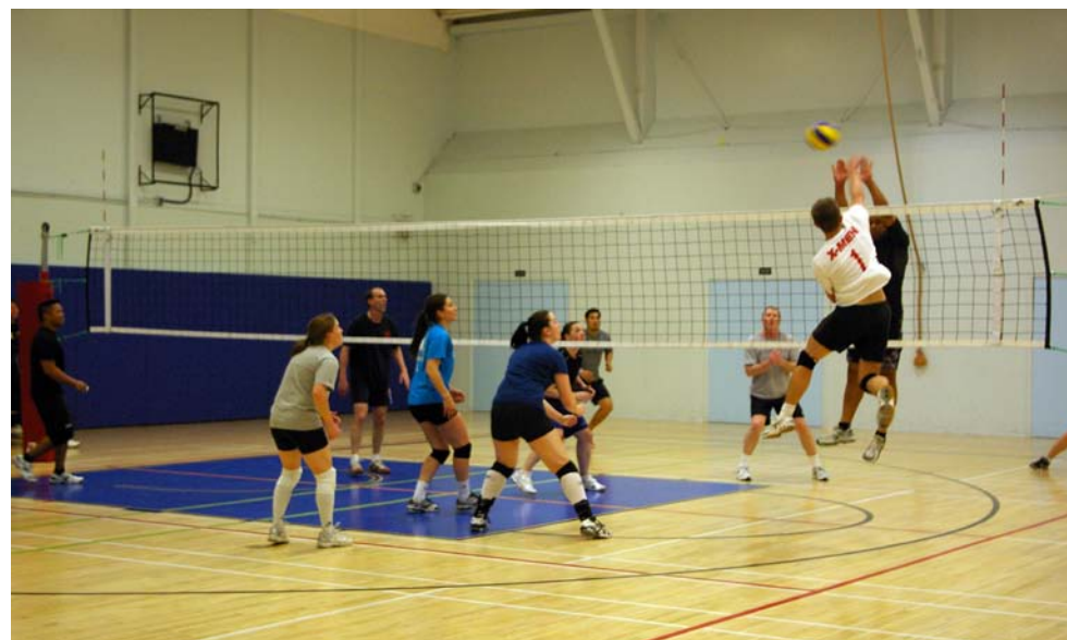
In the A Division final it was Set to Kill vs. Odds and Sods.