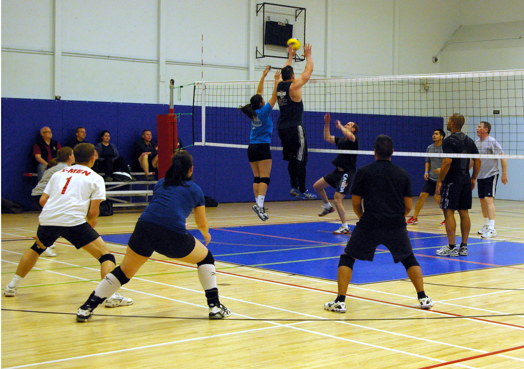
Members of Set to Kill put up the block against Odds and Sods during the A division finals at the Wing Commander's Volleyball Tournament on Friday, April 27th. See Page 9 for more photos and results from the tournament.

IN THIS ISSUE: FORT GARRY HORSE CELEBRATES CENTENNIAL PAGE 7