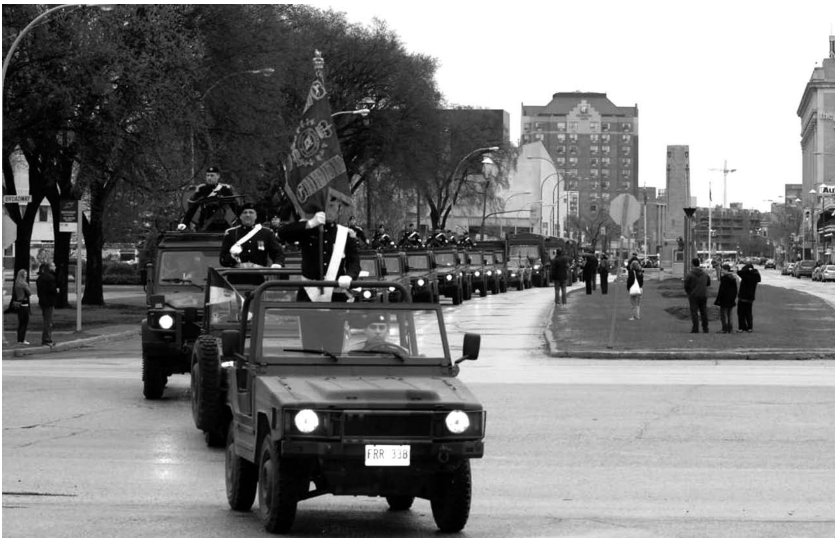
Early Saturday morning a monumental parade of vintage military vehicles from the "ghost squadron" convoyed with the regiment's current fleet of Mercedes G-Wagons to City Hall, where the regiment reaffirmed their Freedom of the City.