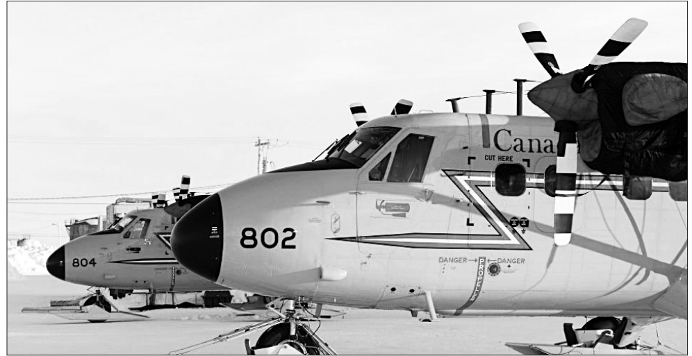
Two Twin Otter aircraft from 440 Transport Squadron, based in Yellowknife, Northwest Territories, sit on the frozen airfield in Resolute Bay, Nunavut, during Operation NUNALIVUT 2012. The aircraft will be used extensively during the Operation to move personnel and supplies within the area of operations.

This year's operation will also feature a Combined Dive Team that will conduct Arctic diving operations in support of Defence Research and Development Canada's Northern Watch Project, and a remotely operated vehicle survey of HMS Breadalbane, a Franklin rescue ship that sank in 1853 and is the world's most northern known ship wreck. As well, 413 Transport and Rescue Squadron from Greenwood, Nova Scotia, and 442 Transport and Rescue Squadron from Comox, British Columbia, will deploy a CC-130 Hercules and a CC-115 Buffalo for approximately five days to conduct High Arctic search and rescue training.