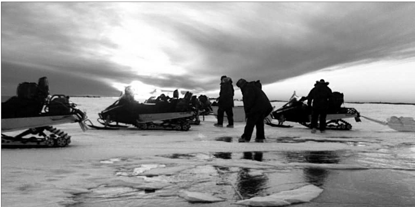
The sun shines over snow vehicles on Greater Slave Lake, NWT