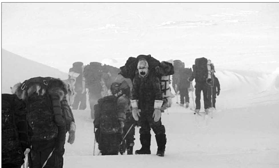
A dismantled forced march through some less than ideal weather in Resolute Bay, NU.

I look forward to deploying back to the Arctic in the coming years so as to gain even more experience and confidence to pass onto my unit, even if it is minus 57.