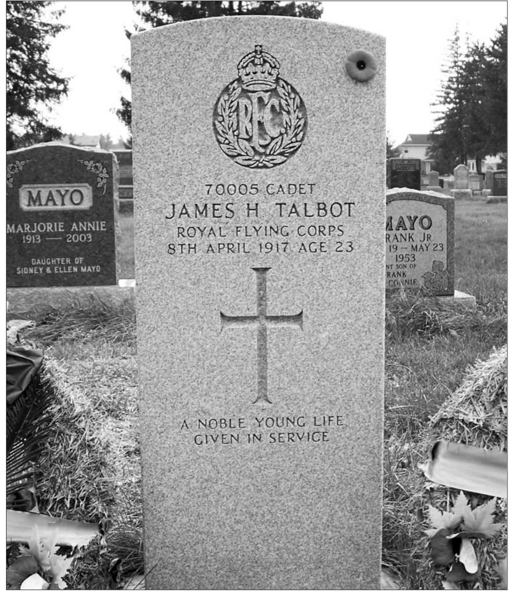
Cadet Talbot's grave in the Union Cemetery in Dorchester, Ont., near London, Ont.