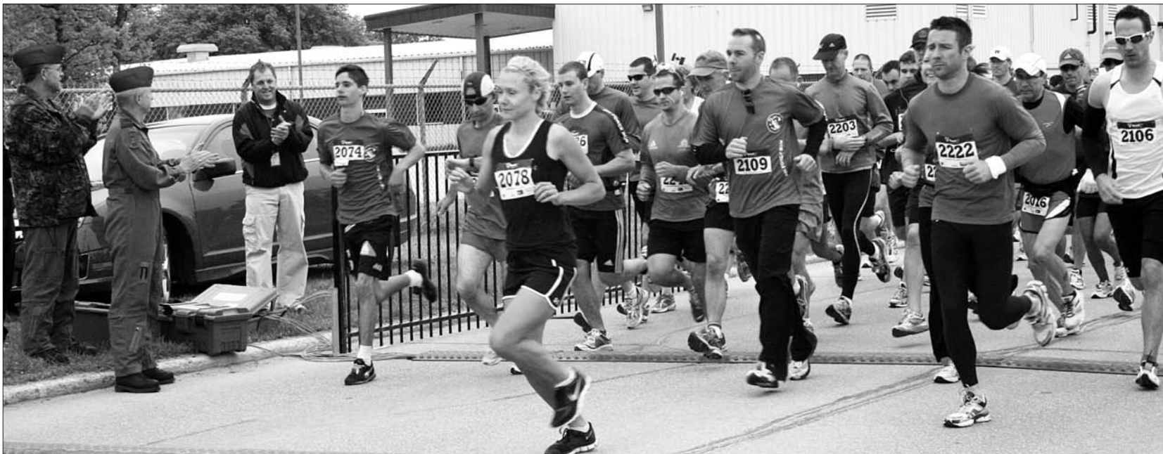
Participants race in the 2011 Air Force Run.