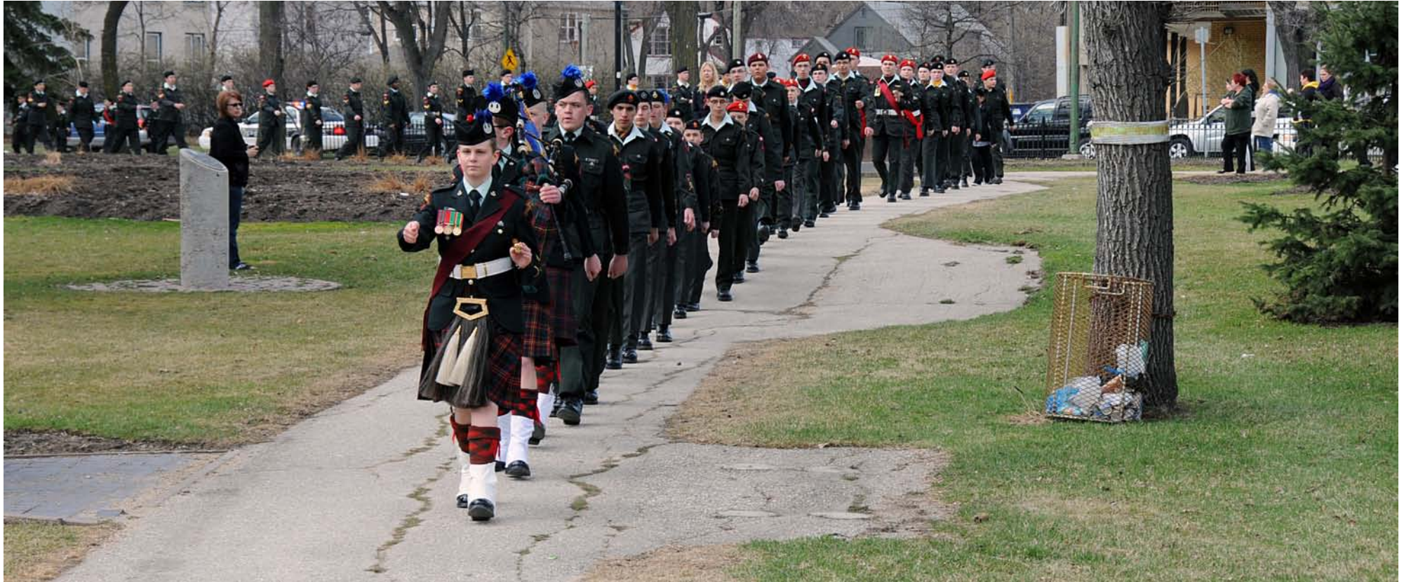
The Cadets, led by a Piper, march through the park to the Vimy Ridge Memorial site after their march from the Minto Armoury some 5 kilometers, to Vimy Ridge Park.