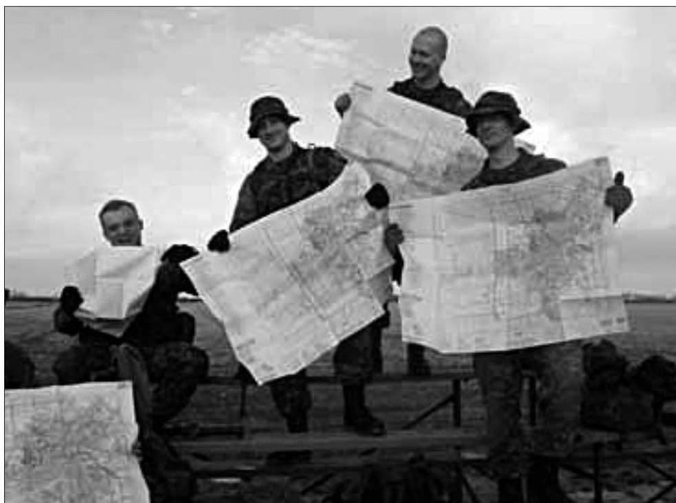
Members of the Winnipeg Infantry Tactical Group felt they may get an advantage over the other teams by claiming all of the maps.