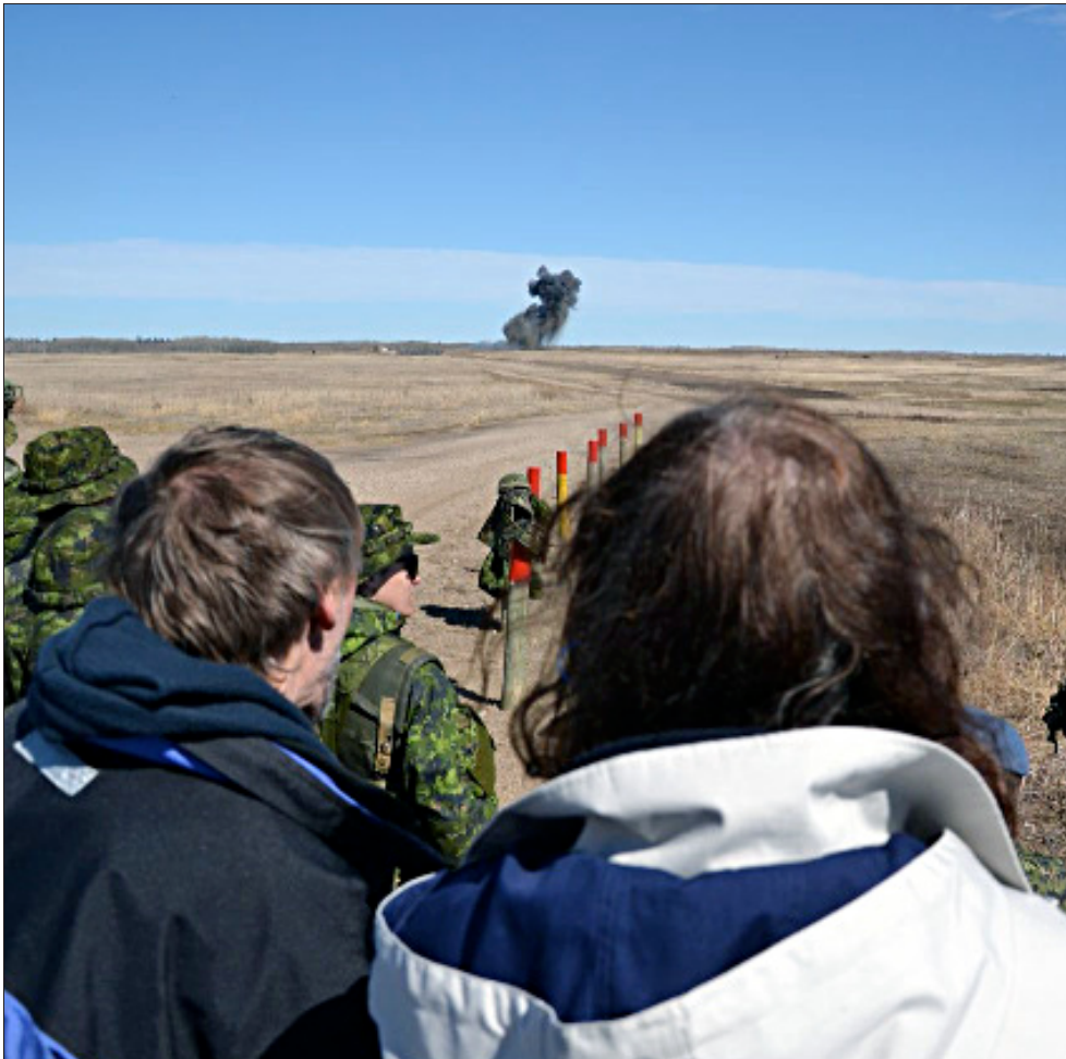
Civilian employers, family members, local media and government officials watch The Fort Garry Horse perform a firepower demonstration at CFB Shilo as a prelude to the Winnipeg-based regiment's 100th anniversary.