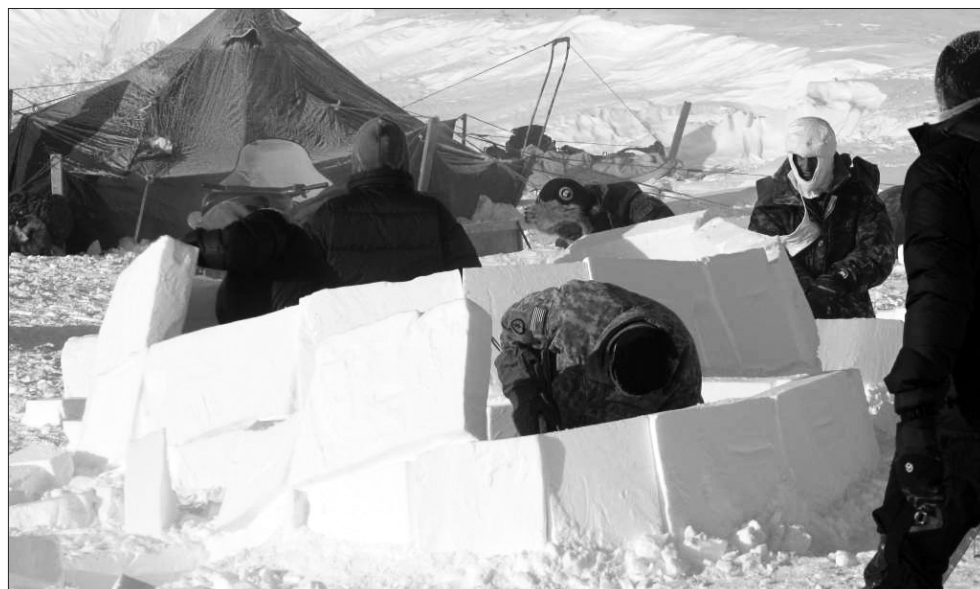
Canadian Rangers demonstrate igloo construction as part of a survival exercises in Resolute Bay, NU.