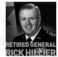
RETIRE GENERAL RICK HILLIER