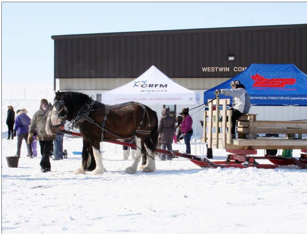
Anyone who came out to enjoy Winterfest on Saturday March 3rd, had the opportunity to try two very different kinds of sledding options by either taking a horse carriage ride in the snow or possibly even trying out dog sledding.

Unseasonably warm weather, combined with a much needed snowfall a few days earlier helped to make the Winter Fest event on Saturday, March 3rd quite an attraction. Crowds of people showed up to enjoy the festival, which was held at the Westwin Community Centre from 12pm until 3pm. Among the activities offered were: horse drawn sleigh rides, snow shoeing, ice skating and dog sled demonstrations. The event was presented jointly by the MFRC and PSP.