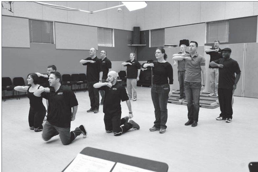
Members of the Royal Canadian Air Force Band rehearse a song and dance number for the Global TV show Canada Sings. The RCAF Band will be competing in the upcoming season of the show for a chance to win money for military causes.

http://www.cfpsa.com/en/corporate/NewsCentre/Support/index.asp