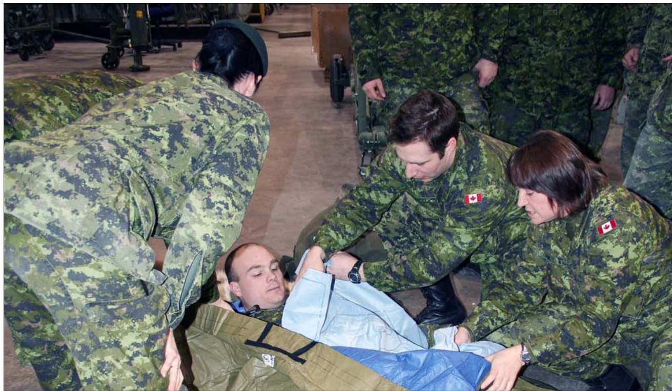
One of the participants of the QL5 conference volunteered to be the patient as his co-workers practised getting him bundled up and ready for transport out of an isolated northern community in order to receive further medical treatment.

when in an isolated area up north, medics are the only ones around that can help an injured patient.