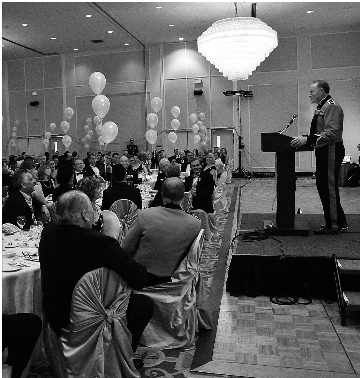
General Walter Natynczyk, Canadian Forces Chief of the Defence Staff, addresses the assembled crowd at the 2012 Yellow Ribbon Gala at the Delta Winnipeg Hotel.

The Yellow Ribbon Gala is the largest, single event fundraiser for the Winnipeg Military Family Resource Centre (MFRC). The role of the MFRC is to support families of regular and reserve force members, including spouses, children and parents. The programs and services offered are designed to strengthen the resiliency of the approximately 6000 military families we serve in Winnipeg, Thunder Bay, and Southport (Portage la Prairie).