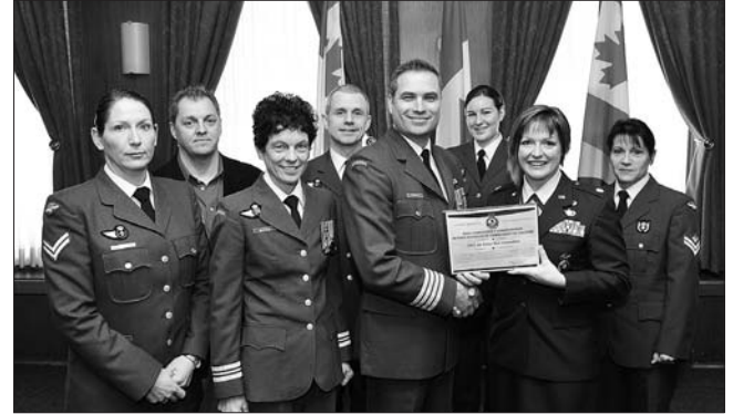
17 Wing Commander, Colonel (Col) Blaise Frawley presents a Wing Commander Commendation to the 2011 Air Force Run Committee.