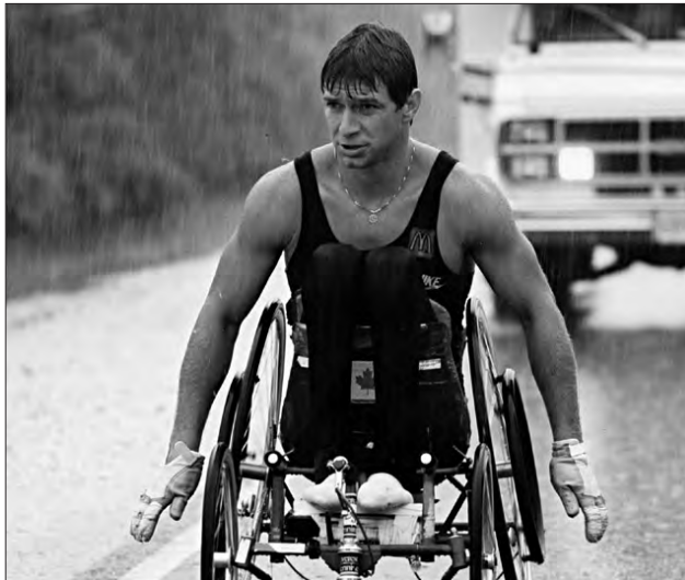
Rick Hansen wheeling through the rain in Salem, Oregon, during the original Man in Motion World Tour.