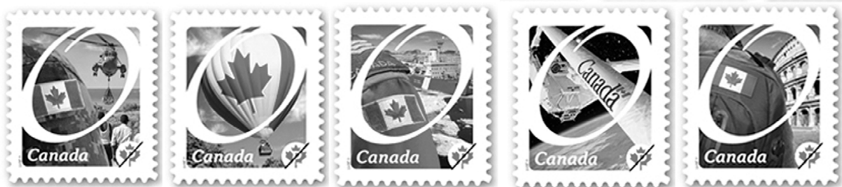
Canada Post has issued a series of five stamps, including two which celebrate the men and women of the RCAF.