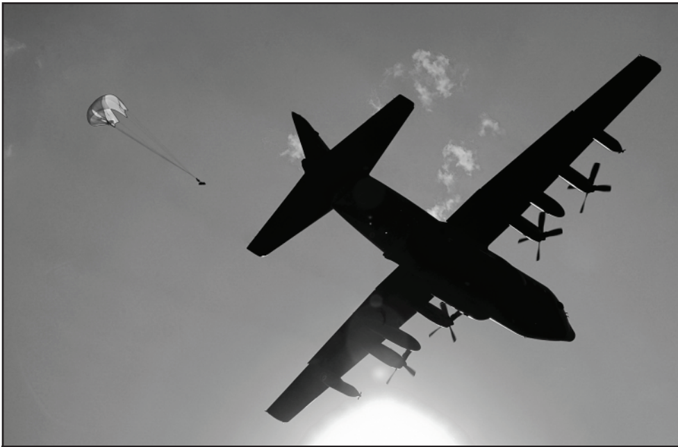
A CC130 Hercules drops a bundle for accuracy during the SAREX.

For more information about how to become a Search and Rescue Technician, please visit: www.airforce.forces.gc.ca/html/searchandrescuetechnician_reg_en.aspx