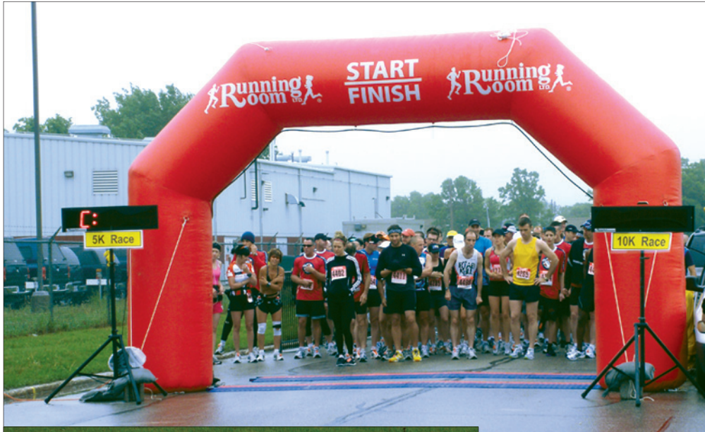
Photo Highlights of the 2nd Annual Air Force Run