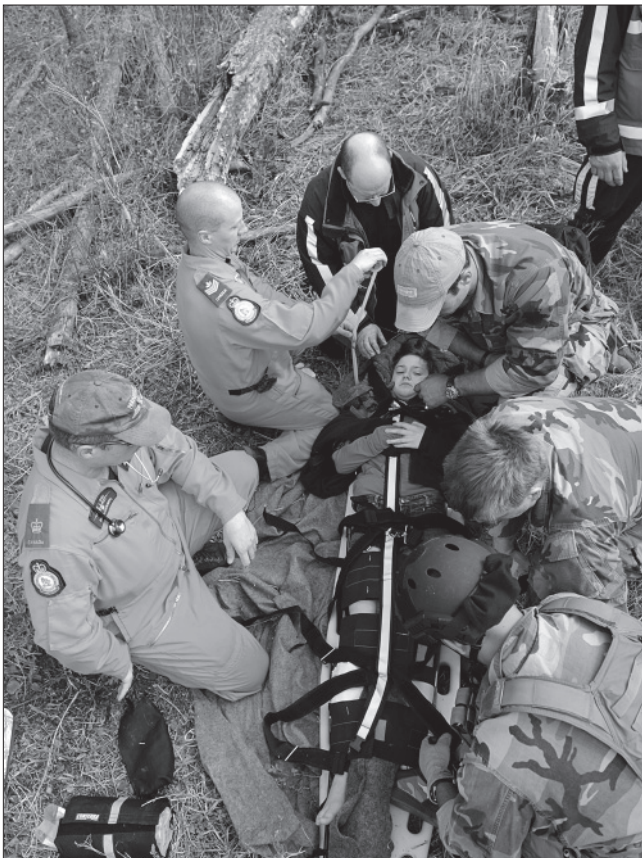
SAREX participants prepare a casualty for air lift.