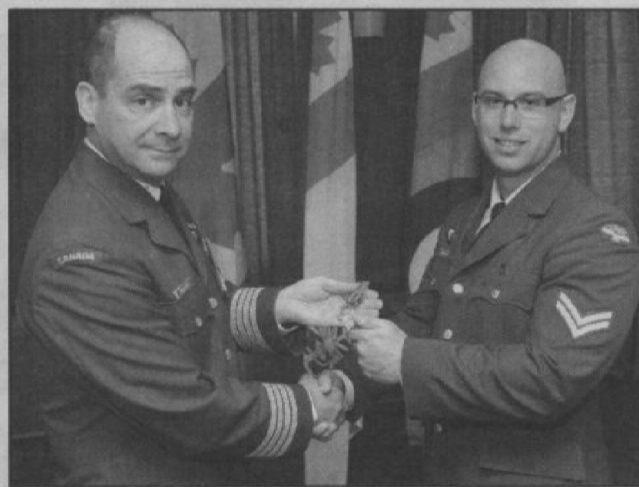
Cpl VM Squires of 435 Squadron with his General Campaign Star (GCS)