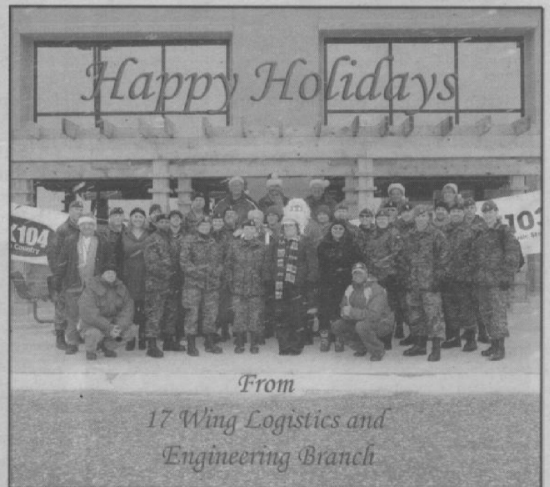
From 17 Wing Logistics and Engineering Branch