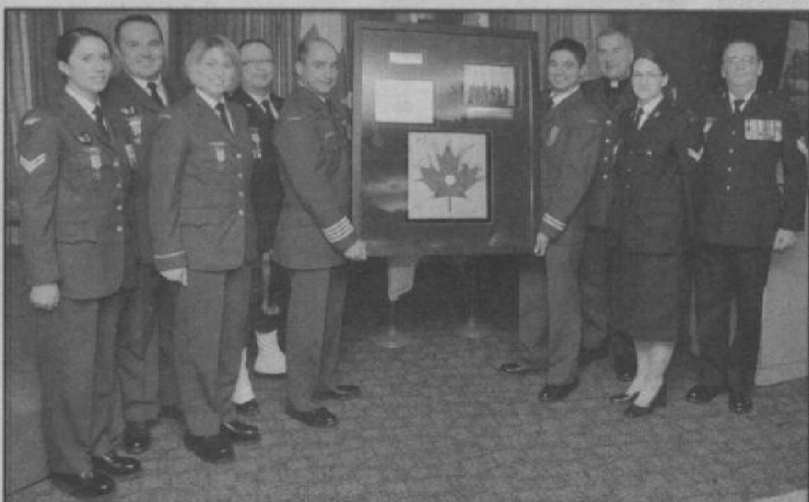
LEFT: The 17 Wing Nijmegen Team receives the Wing Comd's commendation in recognition of their dedication and professionalism during OP Nijmegen 2009.