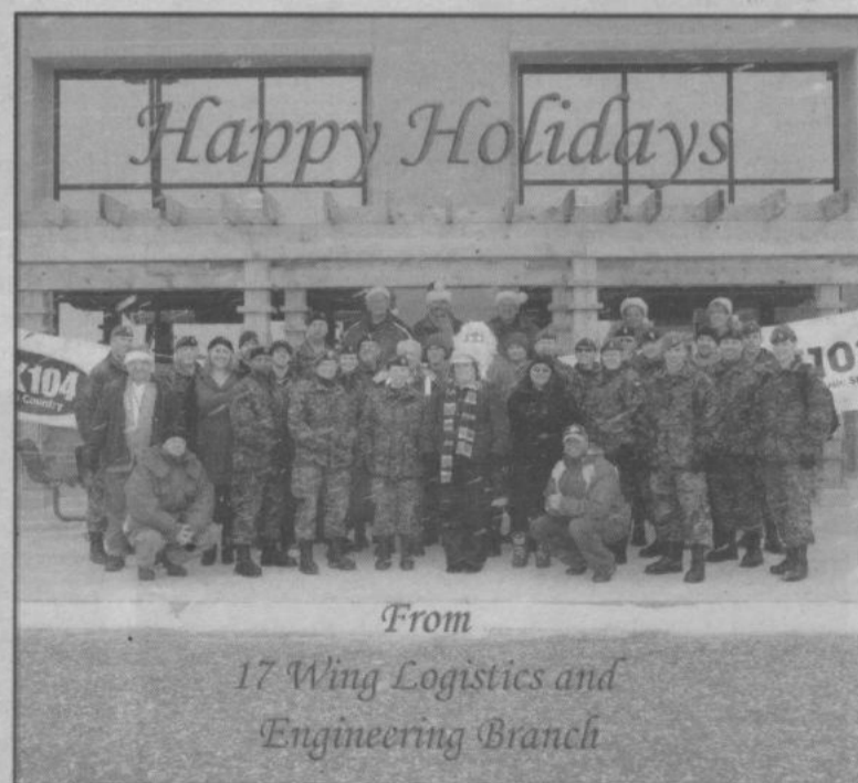
From 17 Wing Logistics and Engineering Branch