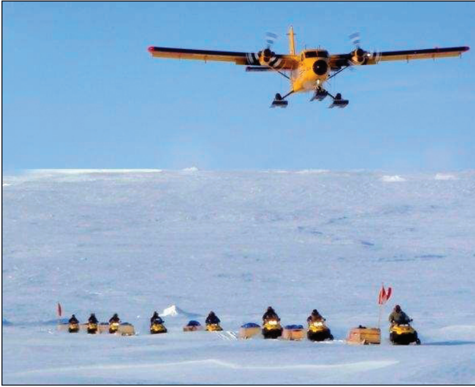
Top: CC-138 Twin Otter overflying Ranger Patrol on the west coast of Axel Heiberg Island, NU