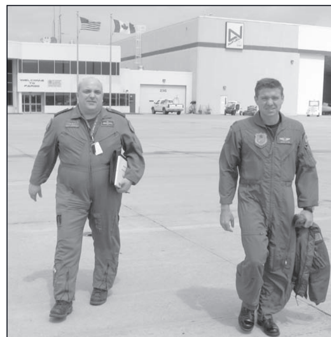
The ICP Flight at CFS has conducted four serials of the new ICP Course, graduating 51 candidates. This level of production has greatly exceeded the maximum output with the previous course design.

two weeks for candidates with previous instructor/evaluator experience, and three weeks for those without previous instructor/evaluator experience. Week one is comprised of classroom instruction and group discussion. Week two involves classroom instruction and a number of video Referent-Rater-Reliability (RRR) scenarios. These scenarios are designed as the “Gold Standards,” based on the expert judgments of ICP Flight and Division ICP staff. They represent the Air Force’s definition of what constitutes acceptable/unacceptable IRT performance. The objective of RRR training is to calibrate new ICPs to this common standard. Candidate feedback on this part of the course has been very positive. ICP students comments included: “Video and analysis are the best part of the course. Thought-provoking and what the ICP course should be about,” and “I think the scenarios are very worthwhile and a very good direction for the ICP course