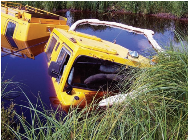
The BV206, in the water, June 2008.

Finally, on 17 January 2009 at 2001 hrs, under its own power, the BV206 was driven out from its resting point on to a waiting flatbed in order to be shipped back to 17 Wing Winnipeg TEME Sqn to under go much need repairs.