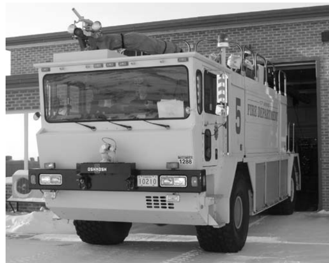
The 17 Wing Fire Department is always ready to assist.

If you have any questions about emergency procedures here at 17 Wing then please feel free to contact the Wing Firehall at local 2646. They'll be happy to help you out.