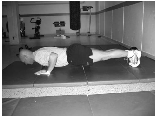
The proper technique for pushups can help strengthen your elbows, shoulders and wrists to keep you in top shape for snowboarding.

1. Lie down on the floor with your hands at shoulder level, palms flat on the floor and shoulder-width apart,