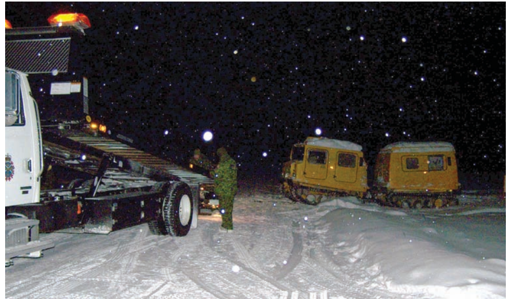
The BV206, under its own power, is driven out of the resting point onto a flatbed. It will be undergoing repairs at the TEME Sqn.

ATVs were utilized by floating them across the riv-