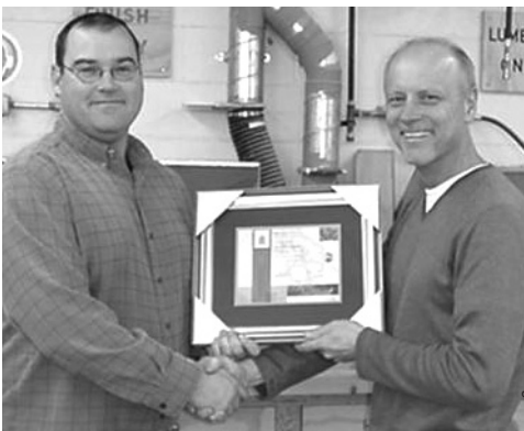
17 Wing CE