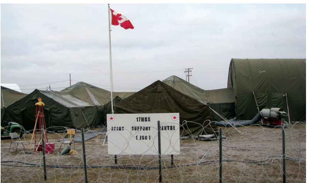
The 17 MSS Joint Support Centre.