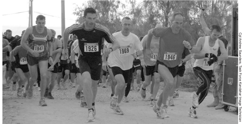
With the blast of a horn, runners begin the 2009 Kandahar Airfield half-marathon. 135 soldiers took part in the run that started early in the morning on January 1, 2009.

"We had a good group of people show up for the race. Some were here aiming for