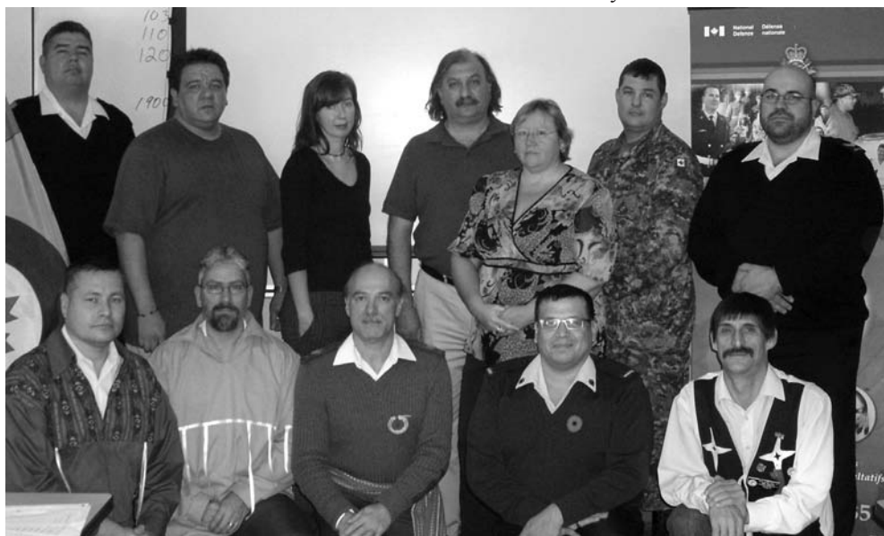
Members of the DAAG National Executive were in Winnipeg recently. Representatives came from all DND bases from Esquimalt to Halifax.