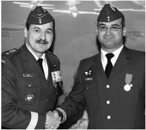
17 Wing CE