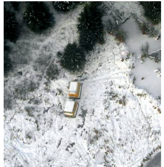
An aerial view, just before the final push.