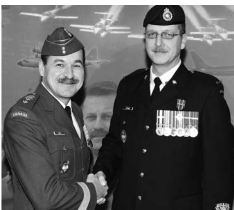
MWO Laforge receives the General Campaign Star.