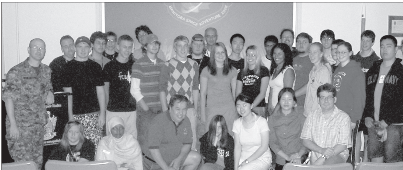
The staff and students of Manitoba Space Adventure 2006 pause for a group photo.

The Graduation Parade for the scholarship cadets who trained in St. Andrews and in Steinbach was held on Friday, August 18, 2006 at 4:00 p.m. on the tarmac of Harv's Air, which is located at the St. Andrews Airport.