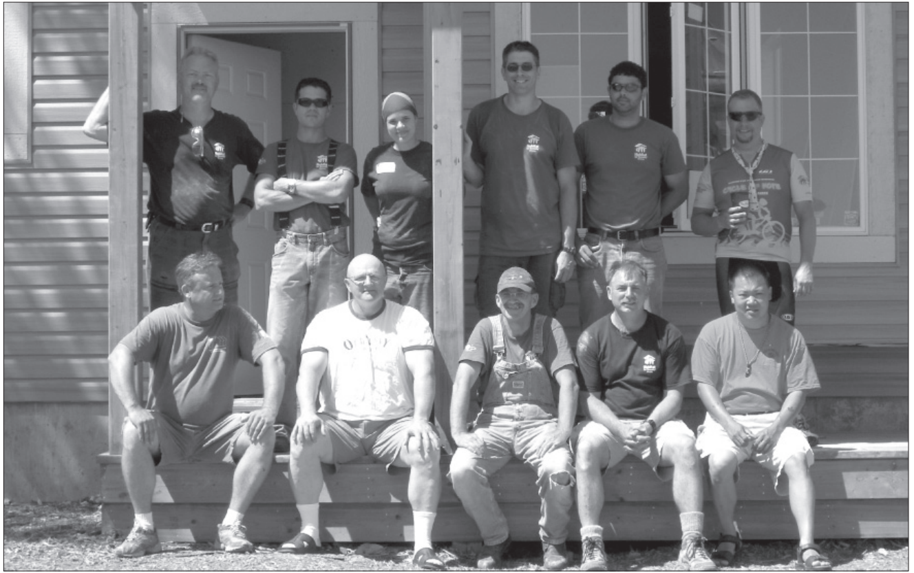
402 Sqn volunteers in front of the Habitat for Humanity house they built.

When we reconvened on Monday, after taking a day of rest to recuperate the sore muscles from the first day, there were enough projects to occupy all of the 30 something volunteers. When broken up into smaller teams, anyone with home renovation experience was considered a “resident expert.” Site foremen with the plans and the know-how ultimately supervised the build, but every smaller group had a makeshift team captain to assign jobs. After the first few