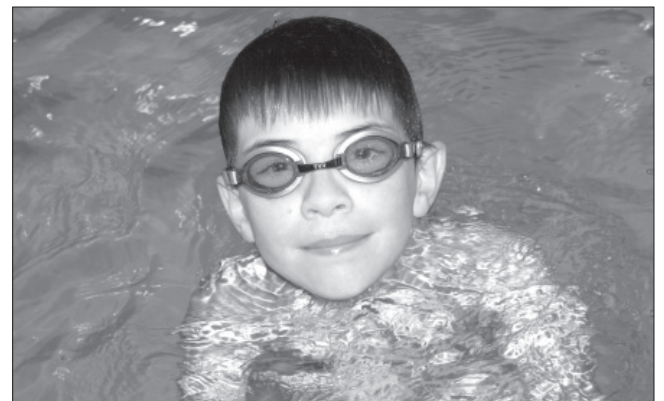
Kids from the MFRC Kidventures camp splashed it up in the pool this summer.

"Don't let back pain keep you from your golf game. See Dr Moran at Sun Chiropractic, just 5 minutes from Base."