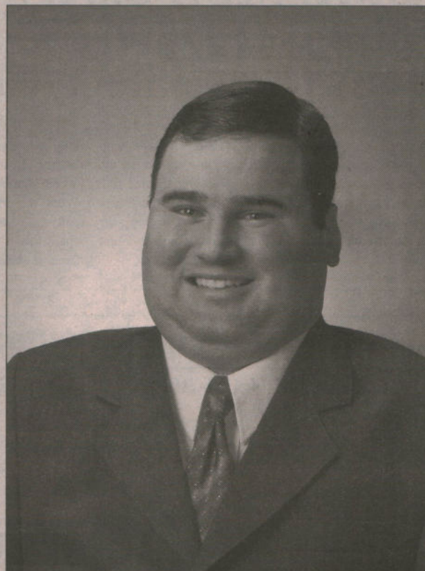
Steven Fletcher, Member of Parliament

For regular updates on Steven Fletcher visit www.stevenfletcher.com