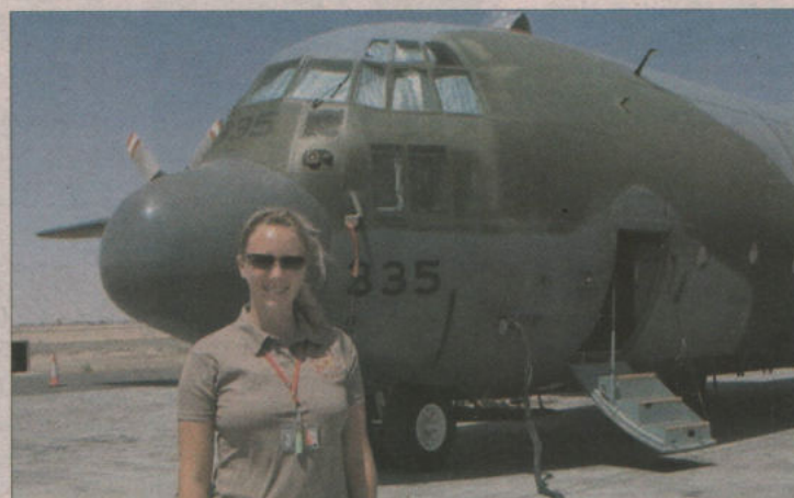
"Home away from home" isn't it?