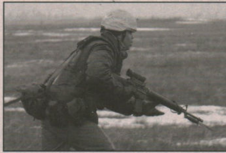
"Next Bound" The soldier takes another bound as he advances towards the enemy during the live fire section attack. Soldiers from the Royal Winnipeg Rifles deployed to CFB Shilo for "Live Fire Training" starting at group level moving up to a full section attack