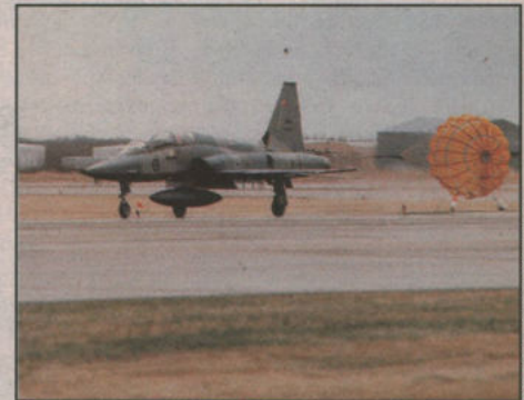
The CF-5 had a high approach speed, even compared to other fighters, and its very clean, aerodynamic lines led to very little speed being lost to aerodynamic drag. Therefore, to reduce wear on the brakes, and especially when it was desirable to cycle Aircraft rapidly through the runway environment, the drogue 'chute was used on occasion to further reduce the Aircraft's speed on landing. -CF Website