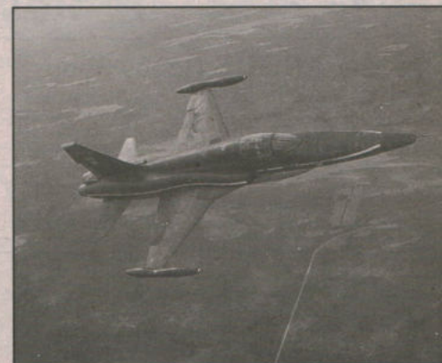
A beautiful angle of a single seat CF-5. The Aircraft was flown in several paint schemes and is represented here in camouflage pattern. In service since 1968, The CF-5 has proven to be a safe, easy-to-fly, tough, fighter Aircraft.