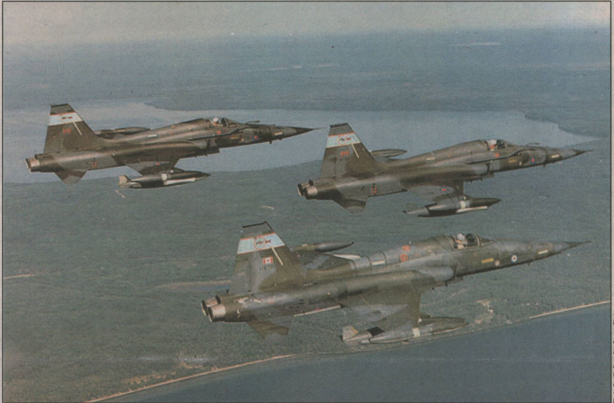
These three 419 (Moose) Tactical Fighter Training Squadron CF-5s of CFB Cold Lake, Alberta are examples of the constant state of evolution and upgrading in the CF to help meet current standards. The two rearmost Aircraft display bolt-on refuelling probes meant to configure the fighter for long-range flight through the support of an air-to-air refueller, as well the same two Aircraft have had their markings altered to a less highly visible configuration by removing the white from the flag insignia on the tail and from the roundel insignia on the nose.

• Voxair Proofreader Wins Novice Bodybuilding Competition