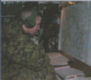
An Infanteer's Introduction to Basic Communications