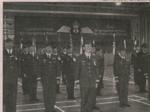
In front of the CFANS banner, the school's graduates stand at attention during their graduation ceremony at Building 21

To the foreign students, he wished "successful ca-