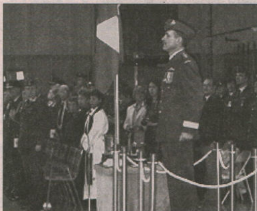
MGen Dumais addresses new navigators at the graduation of CFANS BANC 0206 and 0207 5 December.

reers in your respective countries," and reminded them that Canada, Australia, and Norway are "like-minded countries" that often work side-by-side in missions around the world.