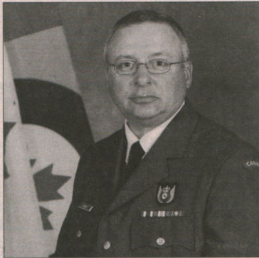
WCWO CWO Parent

My family joins me in wishing you a safe and happy holiday season.