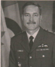
1 CAD Comd Gen Dumais

collectively, our team possesses the intellectual capacity and ingenuity to take these challenges head on and assure that our organization continues to evolve and move forward.