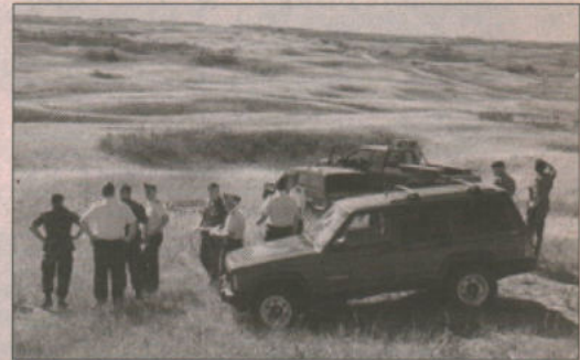
The 17 Wing contingent looks out over Det Dundurn's training area during a tour of the Detachment.

As the CFs only large-scale ammunition disposal