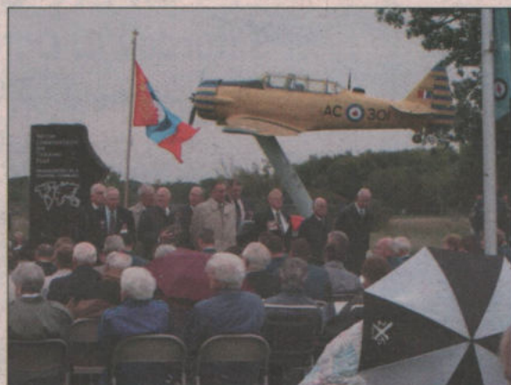
Veterans stand at Heritage Park during a ceremony honouring the 63rd anniversary of the Battle of Britain.