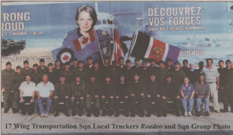
17 Wing Transportation Sqn Local Truckers Roдео and Sqn Group Photo

The winners of each event (1st to 3rd place) proceeded to the Regional Roдео held at CFB Shilo from the 25th to 28th August 03.