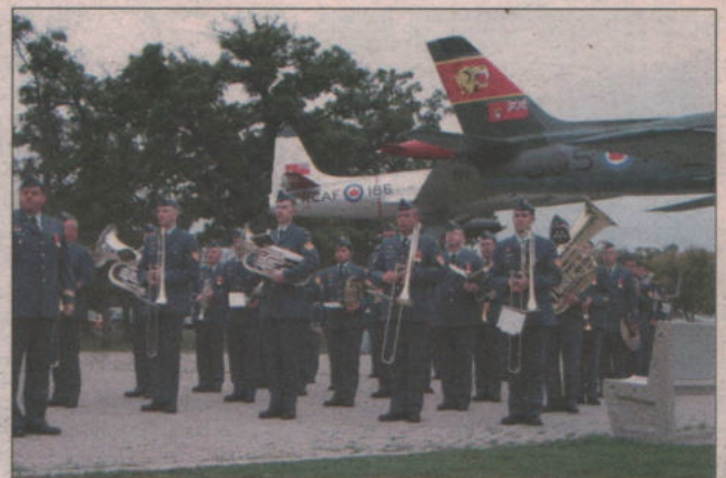
In front of vintage aircraft, the Air Command Band awaits its cue on a rainy Battle of Britain anniversary.