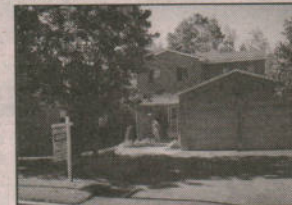
ORLEANS - Ravine living! $179,900. Pristine home with solarium, backing on ravine, 3 bedrooms, 2-tiered deck, some hardwood floors, finished basement. A gem.