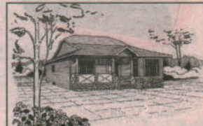
OKOTOKS: 20 minutes south of Calgary. 3 bedroom bungalow. Covered verandah and covered rear deck. 9 foot ceilings, tiled entry, oak railing. Offered at $166,500.

Looking for acreage? Looking for a builder? I can find the acreage. I have the builder. Tamarack Homes. Building quality homes at a fair price.