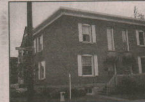
CENTRAL - Charming Glebe end-unit with many upgrades. Kitchen with adjacent family room. Wood floors on both levels. 3 bedrooms, some new windows. $149,900.