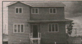
GANDER, $129,900: 2 storey, 4 bedrooms. Living room, dining room, family room with fireplace, eat-in kitchen. Rec room in basement, 1 bedroom apartment. Landscaped, fenced, paved driveway.