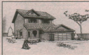
OKOTOKS: 20 minutes south of Calgary. 2,088 sq. ft. 4 bedroom, 2 storey. 5-piece ensuite. Large bedrooms. Living room, dining room combination. Family room with gas fireplace. Offered at $204,000.