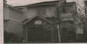
9 NEWPORT CRES., $156,900. Located just south of the city in Hunt Club. 3 BRs, 3 baths, 2nd floor family rm fireplace, freshly painted, loads of TLC. Fabulous kitchen overlooking eat-in area and back deck.