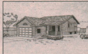
OKOTOKS: 20 minutes south of Calgary. 1,300 sq. ft. backsplitted. 2 bedrooms. Large country kitchen, double attached garage. Offered at $169,900.