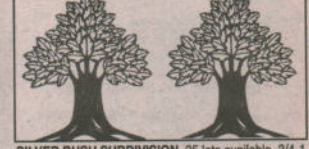
SILVER BUSH SUBDIVISION. 25 lots available. 3/4-1 acre lots- develop fees paid. Build your own home or builder will custom build for you. New home warranty. Other lots in Crysler, Morewood, Berwick & Casselman.