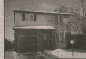
KANATA - Fantastic 4 bedroom home on a wonderful pie-shaped lot. Bay window in kitchen and master bedroom. Family rm with corner fireplace, fully developed basement. $159,900.