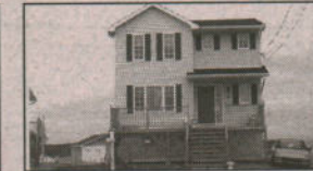
EASTERN PASSAGE, $109,900: Splendid 2 storey home. Inviting country kitchen with island, master bedroom with full ensuite, 3 good size bedrooms, pellet stove and a 5.75 assumable mortgage. MLS.