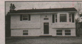
DARTMOUTH: Better than new and ready to go. Lovely oak country kit, 3 lge bedrooms, 2 baths rec room and laundry area has walk-out to yard. Quality home in an area of new homes, walking distance to all amenities.