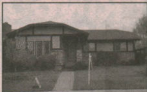
3 BEDROOM BUNGALOW. Wood-burning fireplace, 3-pc ensuite, double detached garage. 1,400 sq. ft. on main level. Basement awaits your development ideas. Offered at $179,900.

Realtor, Royal LePage Suite 321, 12445 Lake Fraser Dr. S.E. Calgary, Alberta T2J 7A4 (403) 225-5000 (bus.) (24 hr. pager) (403) 271-2353 (fax)