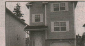
HALIFAX, $142,900: Only 1 year old. Delightful 2 storey, 3 bedrooms, 3 baths, partly finished family room, garage. MLS.