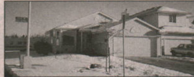
$149,900: This lovely bungalow features two bedrooms plus a den on the main floor, 3 piece ensuite and main floor laundry. The floor plan features the great room concept with cathedral ceilings.