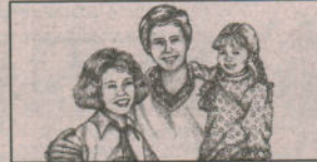
$249,000, 1852 PLAYFAIR. New listing located in Ottawa's most prestigious neighbourhoods. Playfair Park in Alta Vista, just south of the city. Quality speaks for itself! Do not wait, this home is a beauty! A 10 plus!