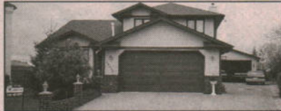
$244,900: This home has it all including two garages - one double attached and a 24 x 38 detached garage. The park-like yard includes a bridge, water stream and lighting. The inside floor plan is spacious and includes 4 bedrooms and formal living and dining room plus more.