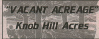
"VACANT ACREAGE" Knob Hill Acres