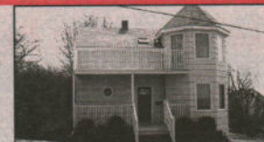
DARTMOUTH, $144,900: Superb home with a SPECTACULAR view of the Halifax Harbour and skyline. Pride of ownership is evident throughout, and it's only minutes to all amenities. MLS.

Sales Reps. / Bilingual Sutton Group-Professional Realty 300 Prince Albert Rd., Paddlers Cove Dartmouth, N.S. B2Y 4J2 902-462-5552 (bus.) 902-462-0123 (fax) 1-800-263-4663 (toll free) email: y_mason@navnet.net