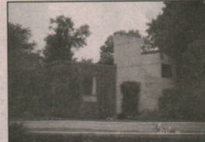
WEST - Wonderful garden and pool with patio and deck. Well maintained 5 bedroom home. Large rec room, 2 full baths. In excellent condition. $139,900.

Sales Representative Coldwell Banker Rhodes & Company 100 Argyle Avenue Ottawa, Ontario K2P 1B6 E-Mail: phyllis@keefe.on.ca (613) 236-9551 (bus.) (613) 236-2692 (fax) (613) 224-0300 (res.) 1-800-771-2775 (toll free)