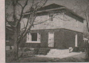
NESTLED - in a warm friendly neighbourhood close to schools and shopping with 3 bedrooms, hardwood floors, fireplace, central air and gas heat. $139,900.