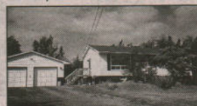
PORTERS LAKE: Excellent buy, 4 bdms, double garage, large lot with Western exposure & deeded access to Lake. Hot water oil heat, screened sunroom & jacuzzi are just a few of the features. 20 min. to Dartmouth.