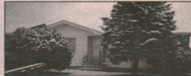
$89,900: This super bungalow is located in Gibbons and includes 3 bedrooms, 2 full baths and double garage. It is situated on a large lot close to schools and located about 20 minutes from the Base.