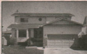
4 BEDROOM 2,000 sq. ft. 2 storey. Lots of oak, gas fireplace, jetted tub, formal dining room. Close to schools. Offered at $199,900.