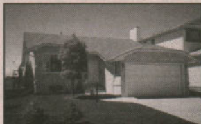
LARGE 1,653 sq. ft. bungalow. Good location, 3 bedrooms, main floor family room and laundry. West backyard, cedar deck. Offered at $194,900.