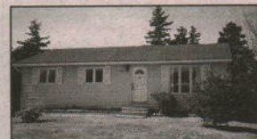
DARTMOUTH: Bungalow backing on greenbelt in the city. Bsmt part finished with room for development. Rec room with woodstove, 1/2 bath & lge laundry/storage area with walk-out to backyard. Super Value!