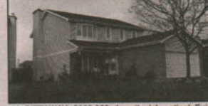
41 PITTAWAY, $209,900. Location! Location! Enjoy this beautiful home backing onto Parkland in the heart of Hunt Club Park. Gorgeous landscaping with a very private backyard enclosed by cedar hedging & fence.