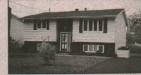
DARTMOUTH: Gorgeous home in mint condition. European country kitchen, 3 large bedrooms, 2 baths. Rec room with woodstove with patio doors to sunny fenced yard. Super location close to everything.