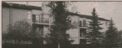
$39,500: Shows extremely well; upgraded carpet, lino, tiles, baseboards, backplash tiles, and light fixtures. Features include fenced in patio area, 5 appliances included and located close to the Base.

Sales Associate Registered Relocation Specialist Re/Max Edmonton 13815 - 127 Street Edmonton, Alberta T6V 1A8 fwhite@connect.ab.ca (403) 457-3777 (bus.) (403) 457-2194 (fax) 1-800-832-9284 (toll free)