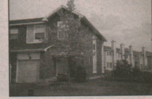
CHAPEL HILL - Affordable 3 bedroom end unit with approximately 1,800 sq. ft. of smoke-free, pet-free living space. Great family room with fireplace. $137,900.