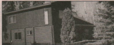
$69,900: This fabulous home is located withing 1 hr drive from Edmonton. Features include an open floor plan with 4 bedrooms, hardwood floors, fireplace and large kitchen. Enjoy country living and still be close to the city.