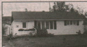
GANDER, $94,500: This 3 bedroom bungalow has much to offer. Hot water radiation heat and wood furnace. Vinyl windows, 2 baths, rec room with wood and a large garage.