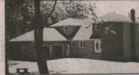
MONTAGUE EST.: Absolutely stunning executive home on large estate lake lot 5 min. to Dart. Designed to take advantage of sunny western exposure & lake view. Too many features to mention, call Ed to view.