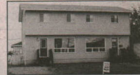
GANDER, $79,000: Duplex, 2 storey, 3 bedroom, living room, dining room, kitchen & bath. Full basement, landscaped, fenced & paved driveway.