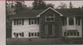
Lawrencetown, $127,500: A MINT HOME! Large private lot hides this impressive 4 bedroom split entry loaded with features. MLS.