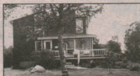
GANDER, $134,500: This unique design has much to offer. Oak eat-in kitchen, family room on main floor. Living room with fireplace, hardwood floors, developed basement, 2 baths, furnace heat and a large lot 70 x 230.