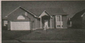
$154,900, ROCKLAND. 3+1 BR home. Approx. 1,851 sq. ft. including finished area in basement, upgraded carpets, rec room, 4th bdrm in bsmt with ensuite, large lot, double garage. Lemay Castell II Model.

Sales Representative 1217 Walkley Road Ottawa, Ontario K1V 6P9 Bus.: (613) 737-7200 Fax: (613) 737-7678 E-Mail: hanlonme@netcom.ca TOLL FREE 1-800-461-3406 RE/MAX Metro City Realty Independently Owned and Operated