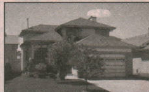
IMMACULATE former show home. Open plan, hardwood floors, gas fireplace, vaulted ceilings, oak package, large master bedroom. Offered at $194,900.