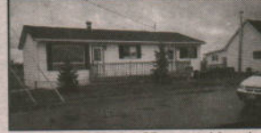
$79,900, CRYSLER. 2+1 BR renovated bungalow. Renovations incl.: front siding, bathroom, some windows, deck, roof, new tile drain & membrane around foundation. French drs off din. rm, new furnace in 95.