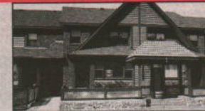
NANTUCKET, $76,500: Ready to move in condition. Spacious 2 bedroom townhome condo in security building. 5 appliances remain. MLS.