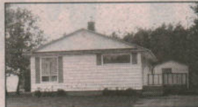
GANDER, $78,000: Impeccably maintained, 3 bedrooms, dining, eat-in kitchen, bathroom, beautiful grounds, shed, paved driveway. Offers invited.