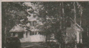
APPLETON, $115,000: Nestled in the trees this newly completed multi-level home is a VIEWING MUST! Oak kitchen, large living room with propane fireplace. 4 bedrooms with 3rd floor loft. Lots of Space. Double car garage and much more.