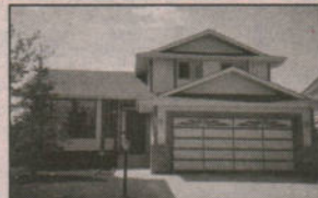
1,865 sq. ft. 4 bedroom 2 storey split. Vaulted ceilings, oak package, underground sprinklers, hot tub. Offered at $204,900.