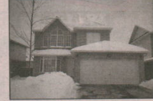
SOUTH - Lovely Minto 3 bedroom home with numerous upgrades. Hardwood in living room and dining room, vaulted ceiling in family room, dramatic master bedroom. $214,900.