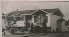
GANDER, $116,500: Split entry bungalow has eat-in kitchen, living room, dining room, rec room with wood stove, basement apartment. Landscaped, fenced and paved driveway.