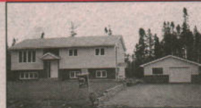
LAWRENCETOWN: What a beauty, great layout with open concept on large country lot + detached garage. 4 bedrooms, 3 baths, formal dining room with french doors. Cozy rec room with woodstove + hearth.