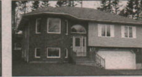
COLBY SOUTH, $172,900: Gorgeous R-2000 home located in exclusive subdivision boasts hardwood & ceramic floors, upgraded fixtures, propane fireplace & a huge double garage. MLS.