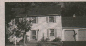
BEDFORD, $219,000: Prestigious Paper Mill Lake. Tranquil setting with private yard backing on brook. 4 baths, 3/4 bedrooms, fireplace & rec room, woodstove & 2 decks.