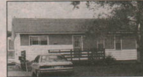
GANDER, Just $79,500: This bungalow has hot water radiation heat, almost all new windows, 1 bedroom basement apartment and greenbelt location.