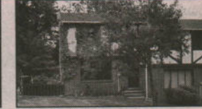
SACKVILLE, $72,500: The upgrades have been done in this spacious 3 bedroom end unit townhouse. Fenced yard ideal for children and pets. Walking distance to amenities. MLS.