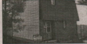
$86,900, GLOUCESTER. 3 Bedroom court home. End unit, rec room and 2-piece in basement. Hardwood in the bedrooms. Good sized rooms. Dining room.