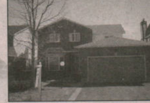
BARRHAVEN - Stunning Hoiitznr built 4 bedroom backing onto passive park. Country sized kitchen, main floor family room, close to schools. $219,900.