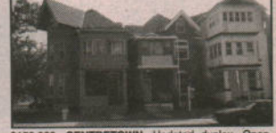
$159,900, CENTRETOWN. Updated duplex. Open concept with 9 ft. ceilings. 2 bedroom upper suite has been updated. Think level awaiting your touches.