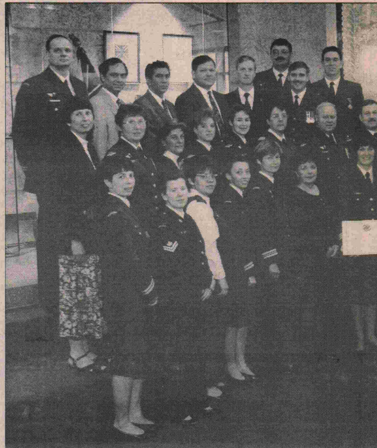
Receiving the Deputy Minister and Chief of the Defence Staff Renewal Award f