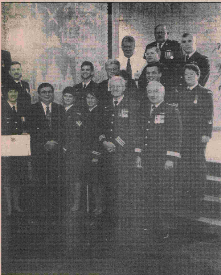
Award from the Commander of Air Command is the Flight Plan 97 Team.