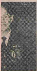
Leberry (Ops) - SSM