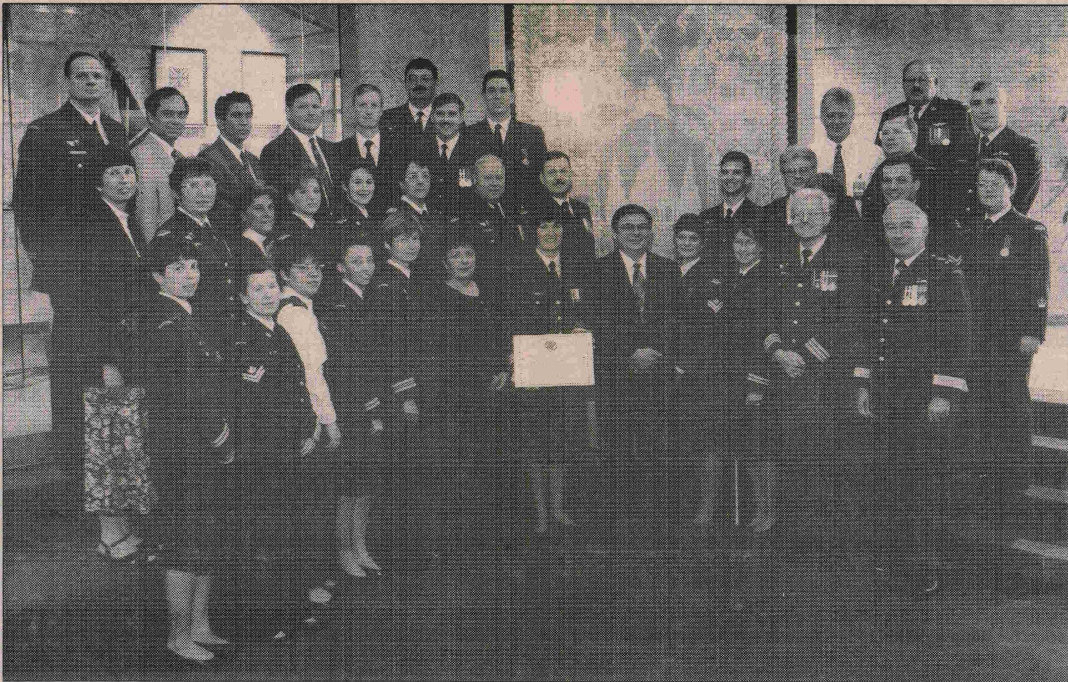
Receiving the Deputy Minister and Chief of the Defence Staff Renewal Award from the Commander of Air Command is the Flight Plan 97 Team.