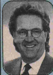
1996 Re/Max Platinum Club