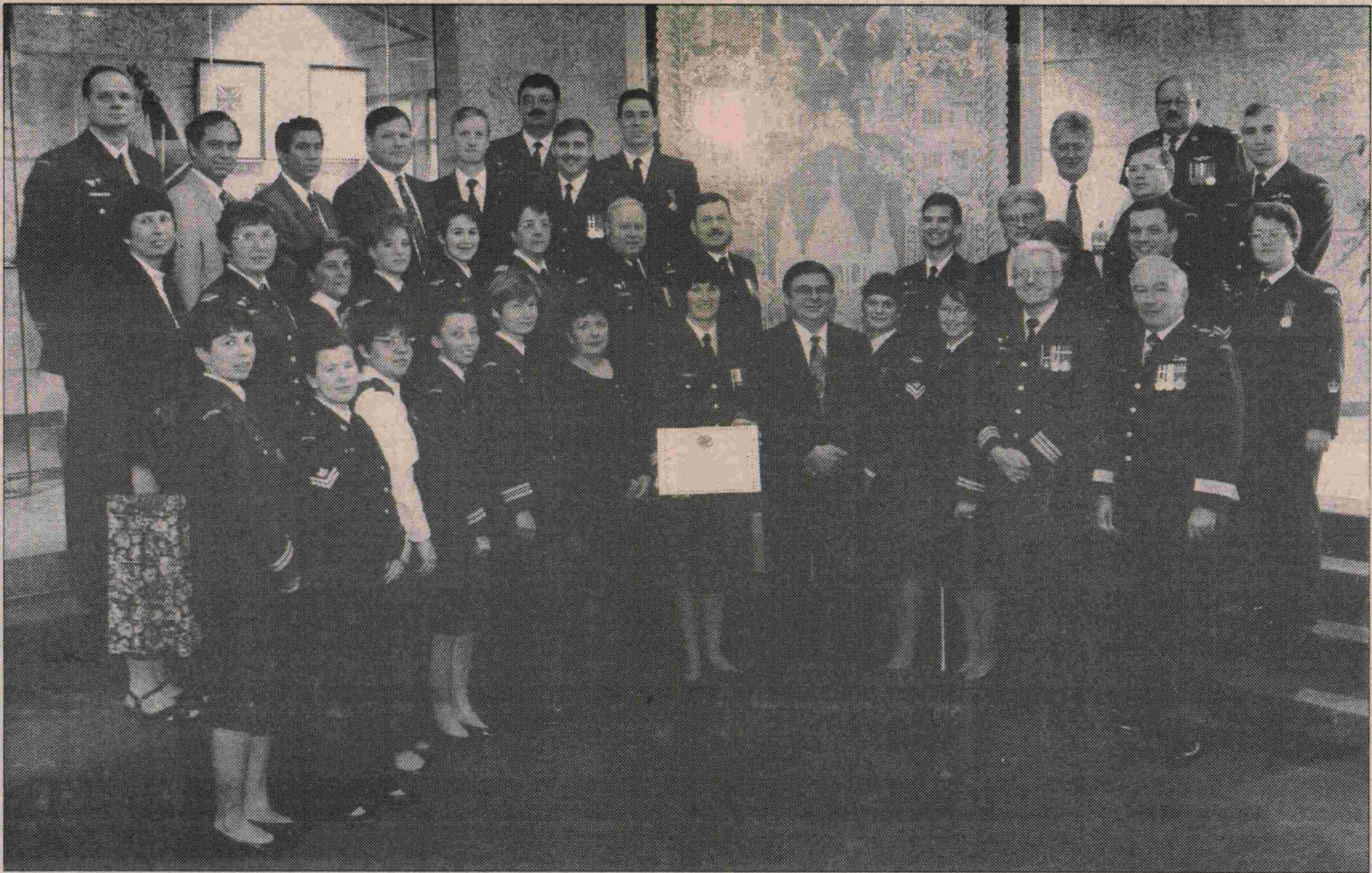
Receiving the Deputy Minister and Chief of the Defence Staff Renewal Award from the Commander of Air Command is the Flight Plan 97 Team.