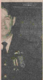
Leberry (Ops) - SSM