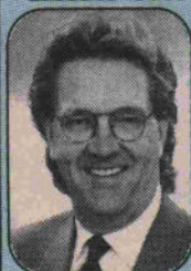
1996 Re/Max Platinum Club