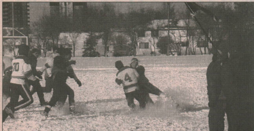
2 PPCLI held its annual French Grey Cup tournament on Friday, 10 November.