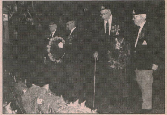
Veterans from the War Amps and Hong Kong Veterans Association prepare to lay wreaths during the Remembrance Day service on November 11, 1995.

When the time comes to deliver on the commitment to Canada and Canadians that each of us has made, I know that we will be there. However, I suspect that, just like sixty years ago, the "security experts" in the national media will be nowhere to be seen until afterwards, at which time they will come forward, criticize the sacrifices, praise the enemy, condemn the