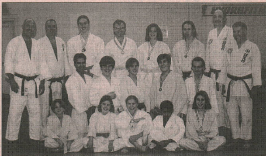
17 Wing Judo Club Competitive Team - Brandon Open 95