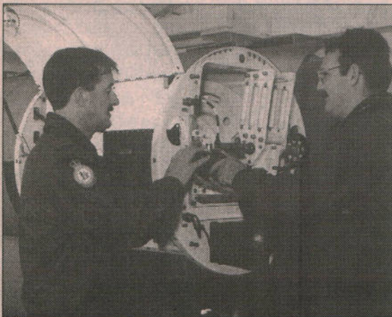
Techs work on the MK 32b Refuelling Pod in their new POD Shop.

CFANS hockey team has finally won their first game. Their strategy of lulling the opposition into a false sense of security seems to have been successful and now they say they are ready to pounce on the rest of the league.