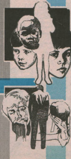
Canada Safety Council