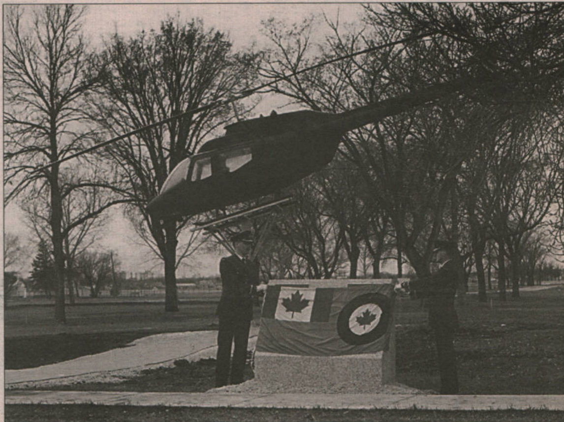
The CH-139 Kiowa awaiting its unveiling.