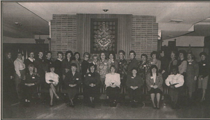
And here they are! 17 Wing's Secretaries

These very special individuals consistently provide courteous and enthusiastic assistance, and always with a smile (well, almost always), and seem to be the ones who really know what's going on around here. This is a formal recognition for the outstanding work they do, and support and dedication they demonstrate. Well done, ladies!