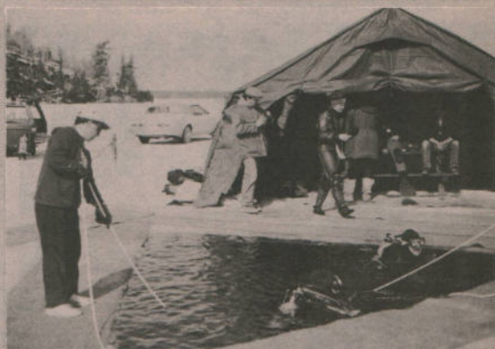
Goldeyes - Under the Ice

Bears hibernate during the winter but scuba divers still like to get wet, regardless of the season. That is why the CFB Winnipeg Goldeyes Scuba Club, once again, held their annual ice dive on the weekend of March 21st and 22nd. It was an extremely busy two days with the sanctioned club dive, an ice diving course and the Club's responsibility to organize and conduct the Manitoba Underwater Council (MUC) dive.