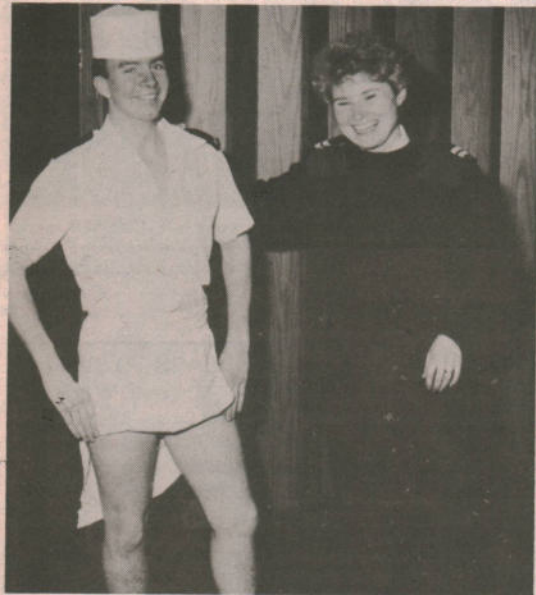
"The Real Promotion" who says cooks don't have fun?