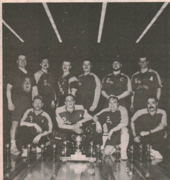
Champions of the Intersection League and Base Commander's Tournament.

On 16 March 1992 the CFB Winnipeg Inter-Section Floor Hockey League concluded its season with a best 2 out of 3 championship series between BEME and 2PPCLI. The game was fast and furious. The Patricia's with some difficulty, took the crown over BEME - 2 games straight. The season then moved over to the Base Commander's Floor Hockey Tournament 20 April 1992. Eight teams played Floor Hockey all day, under the blazing fluorescent lamps of Lipsett Hall and Building 21. With the eagerness to win on their faces and curves in their blades, the tournament finished as it started, with a bang. And, yes, you guessed it. The Championship game consisted of BEME vs 2PPCLI. Once again the Patricia's took the crown. The BPERO wishes to congratulate all the teams that participated in both the Inter-Section Floor Hockey League as well as the Base Commander's Tournament. See you in the fall.