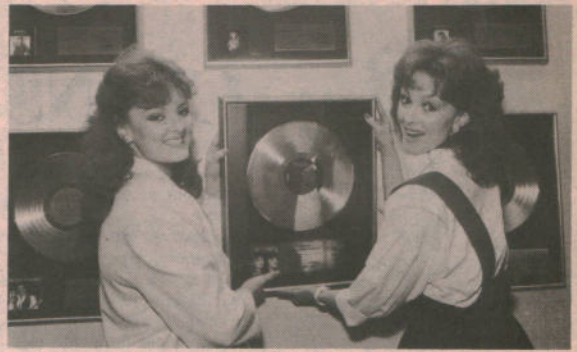
Daughter Wynonna, left, and Naomi Judd are seen hanging their first gold album for "Why Not Me". The duo sold in excess of 10-million records and Wynonna is currently enjoying solo success with her self-titled album and chart topping single "She Is His Only Need".

If "Bandwagonesque" (DGC) brakes big on this side of the Atlantic, the four members of Teenage Fan Club (Norman Blake, Raymond McGinley, Gerard Love, Brendan O'Hare) may very well have to contend with having a huge fan club.