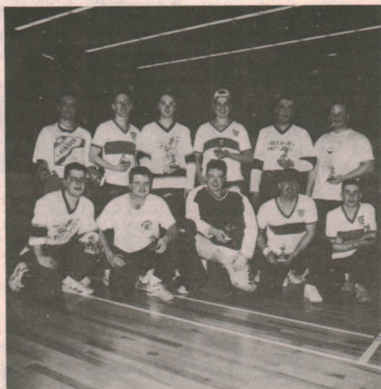
Runners-up of the Intersection League and Base Commander's Tournament.

On 16 March 1992 the CFB Winnipeg Inter-Section Floor Hockey League concluded its season with a best 2 out of 3 championship series between BEME and 2PPCLI. The game was fast and furious. The Patricia's with some difficulty, took the crown over BEME - 2 games straight. The season then moved over to the Base Commander's Floor Hockey Tournament 20 April 1992. Eight teams played Floor Hockey all day, under the blazing fluorescent lamps of Lipsett Hall and Building 21. With the eagerness to win on their faces and curves in their blades, the tournament finished as it started, with a bang. And, yes, you guessed it. The Championship game consisted of BEME vs 2PPCLI. Once again the Patricia's took the crown. The BPERO wishes to congratulate all the teams that participated in both the Inter-Section Floor Hockey League as well as the Base Commander's Tournament. See you in the fall.