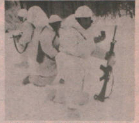
"Doherty, I think we're lost already."