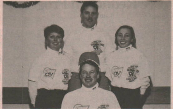
Pictured above are some of the 1991 Grey Cup volunteers.

The excitement is over and Grey Cup 91 lives as a memory in the minds of the nation and as a wonderful experience for the many volunteers involved. CFB