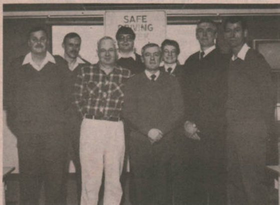
Safe Driving Week prize winners and MSE Safety personnel, left to right.