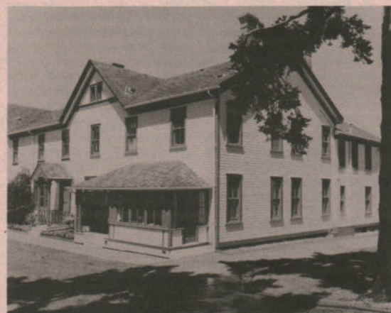
The famous east side of the Officers' Mess where most of the phenomena occurred.

"I went to see my neighbors to check if they had seen anything... no, I was the only one..."