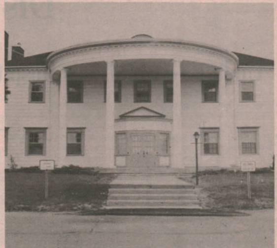
Front view of the CFB Cornwallis Officers' Mess.

Another officer experienced incredible moments in that same part of the building. He is a former member of the 3 PPCLI, who stayed many years in the building and who prefers to keep his anonymity, for obvious reasons. According to him, the Officer's Mess is truly haunted. His conviction