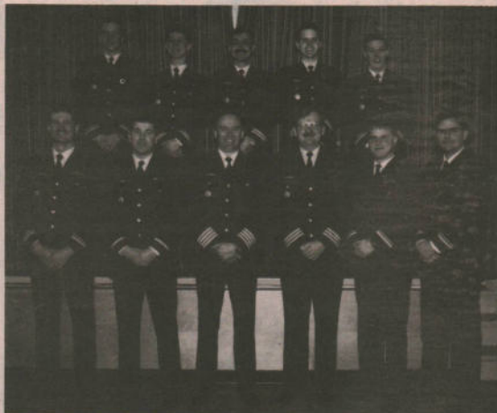
Basic Air Navigation Course 9003. Wings Graduation Ceremony.

On Friday 22 Feb a CFANS staff crew departed for Whitehorse for that city's annual Sour Dough Rendezvous. The trip not only provided proficiency training for instructors but the crew hosted a static display of the CT142 for the public. See our next edition for the follow up story and photos.