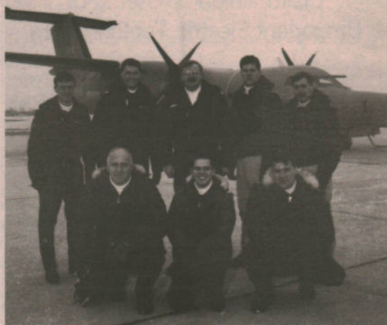
Crew of the First Student Navigation Detail Aboard Gonzo.