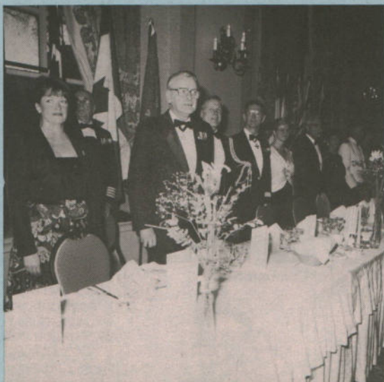
Head table of the mixed dining-in at the Fort Garry Hotel.