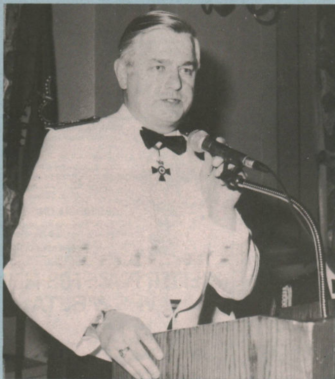
LGen Fred Sutherland addresses the assembly of the mixed dining-in at the Fort Garry Hotel.