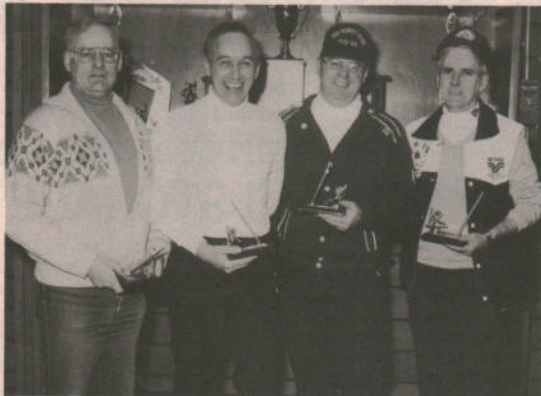
SSO TN "C" Event Bonselpiel winners.