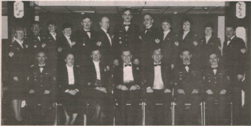
Prior to moving off to the Dining Room for the Base Supply Mess Dinner, the WOs & Sgts gathered for a group photo.