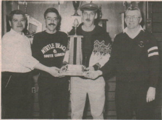
SSO AF "B" Event Bonselpiel winners also tied with BTNO for "B" Event Round Robin finals.