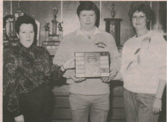
BPERO "C" Event Round Robin winners.