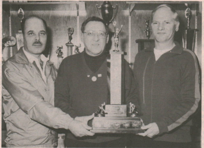
BAMEO/ASO "A" Event winners for both the Round Robin and Bonselpiel.

"A" Event BAMEO/ASO "B" Event BTNO/SSO AF (tie) "C" Event BPERO "D" Event BHosp