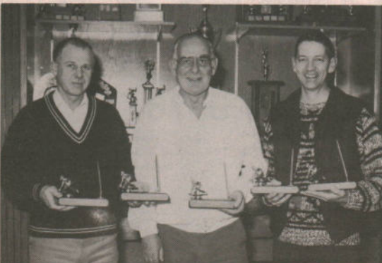
SSO Cadets "D" Event Bonselpiel winners.