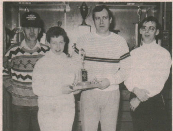
BHOSP "D" Event Round Robin winners.