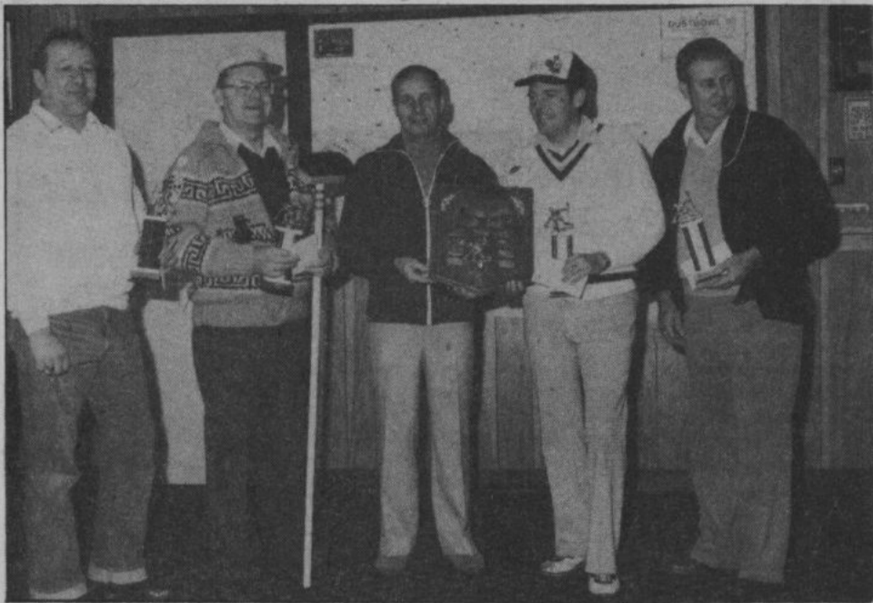
AIR TRAFFIC CONTROL