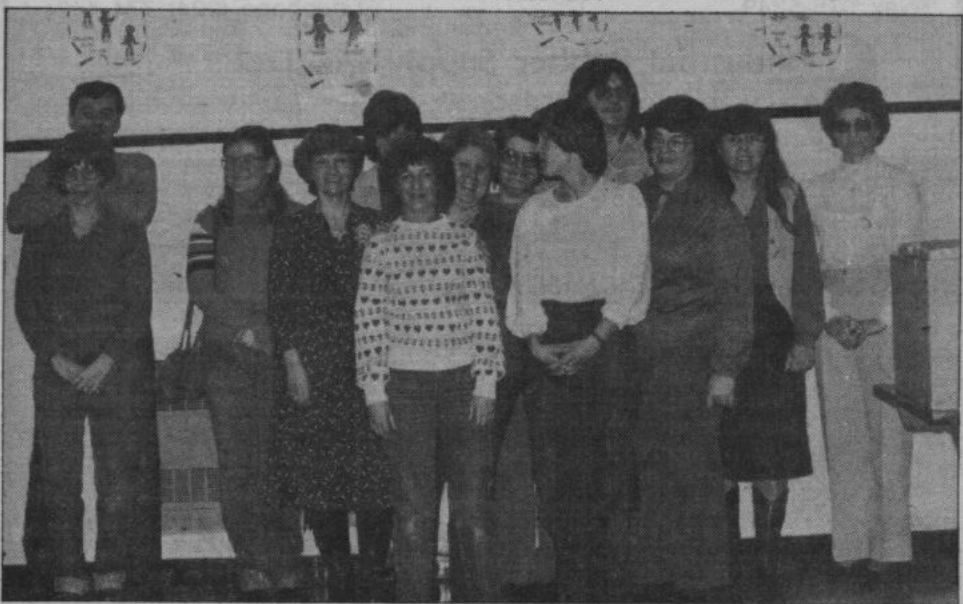
These are the Parent Volunteers who always show up to help dish out the food, take care of the kids and so on.