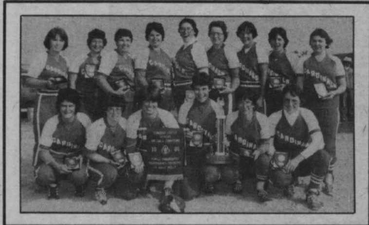
CFB Winnipeg hosted the CF Servicewomen's National Softball Championship from the 14 - 17 Sept. 81. Shown above are the CF Servicewomen's National Softball Champions, CFB Cornwallis, Atlantic Region. Congratulations ladies!