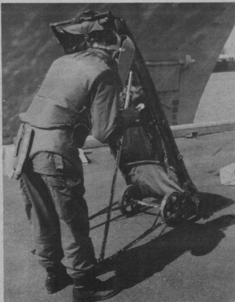
A Canadian Forces explosive ordnance disposal (EOD) technician, behind a protective shield, examines a package left on a jetty where a Canadian naval vessel is alongside. With a stethoscope the EOD expert will examine the package externally to determine whether or not it is lethal, and then dispose of it. Military EOD teams handled 479 disposal operations during 1977.