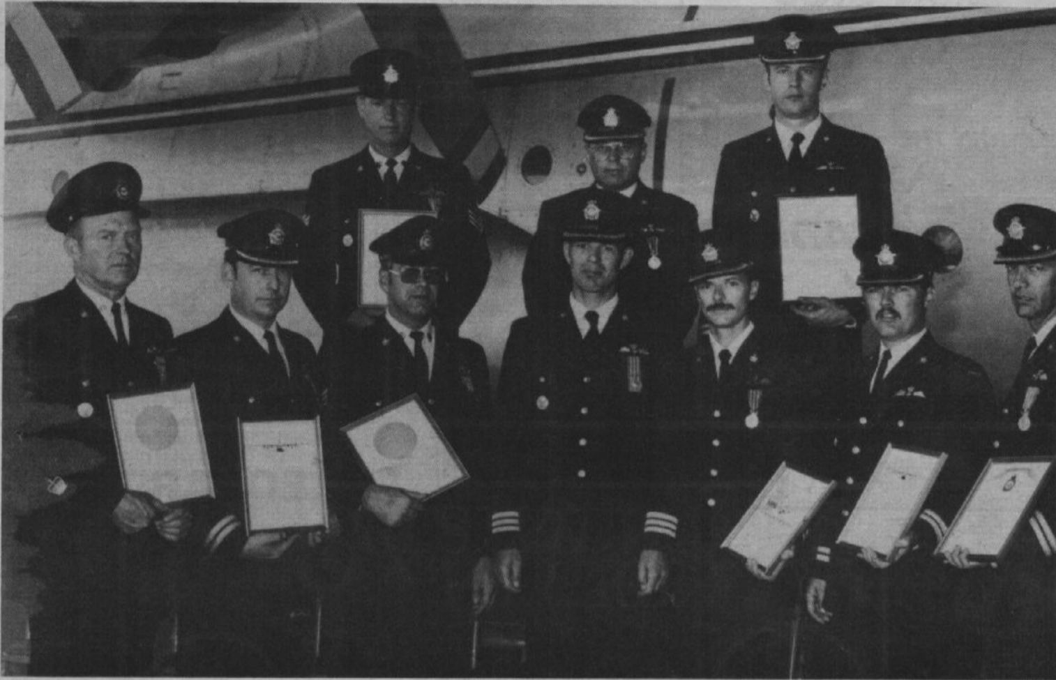
FLYING AWARDS FOR 429 SQN