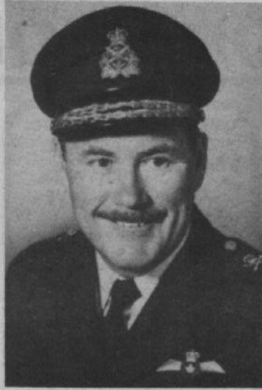
BGEN LV JOHNSON