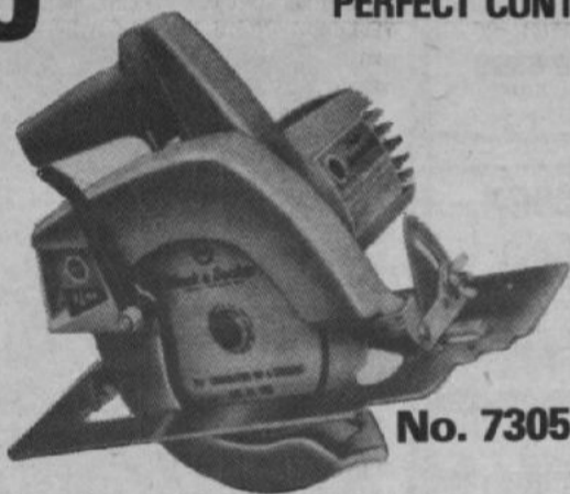
7 1/4" CIRCULAR SAW & BURNOUT PROTECTED MOTOR