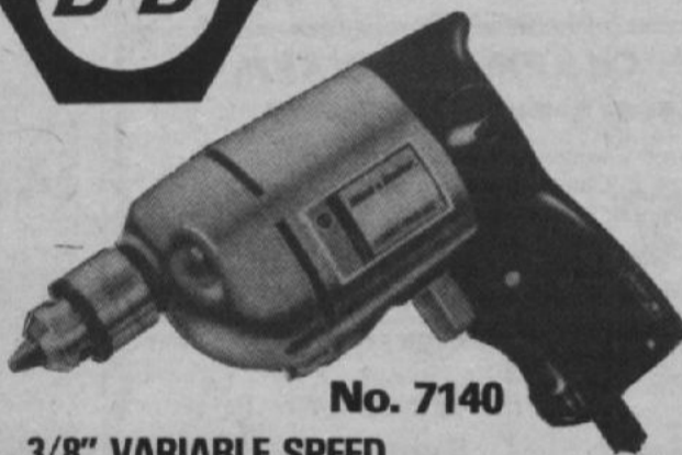
No. 7140 3/8" VARIABLE SPEED REVERSING DRILL FOR PERFECT CONTROL