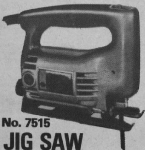
No. 7515 JIG SAW WITH TILTING SHOE

ALL TOOLS CARRY ONE YEAR REPLACEMENT GUARANTEE