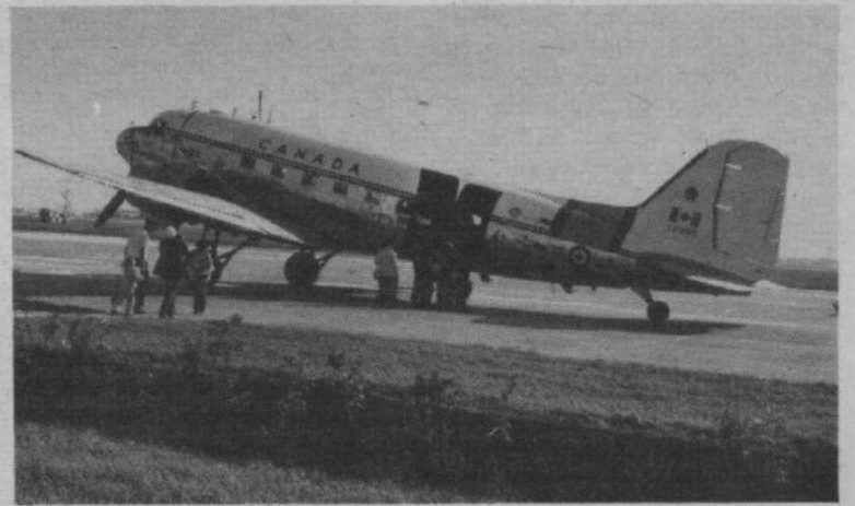
Several enthusiastic dependents board one of the three C-47's flown by 429 at the CFANS Family Day.

Family Day was again a success. See you there next year.