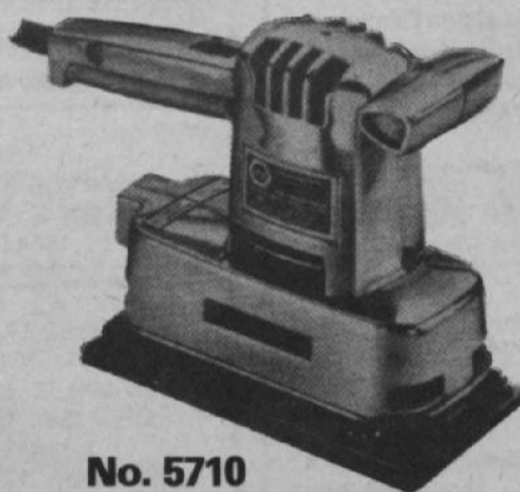
No. 5710 SANDER DELUXE DUAL ACTION FINISHING - 25 SQ IN OF ORBITAL SURFACE.