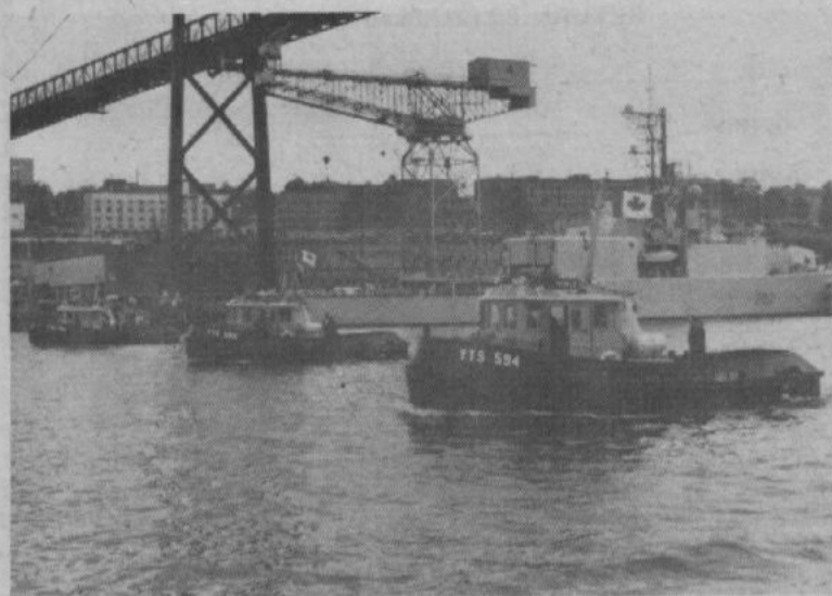
Maritime Command's newest auxiliary vessels, the tugs Listerville, Merrickville and Marysville, are introduced to the east coast fleet during a sail-past up Halifax harbour Sept 11.

HALIFAX . . . Maritime Command officially accepted three modern harbour tugs into its auxiliary fleet in a signing ceremony and sail-past at HMC Dockyard, Sept. 11.