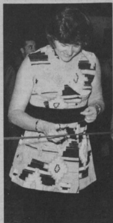
JUNIOR RANKS CLUB OFFICIAL OPENING

A bus backed through my windshield into my wife's face.